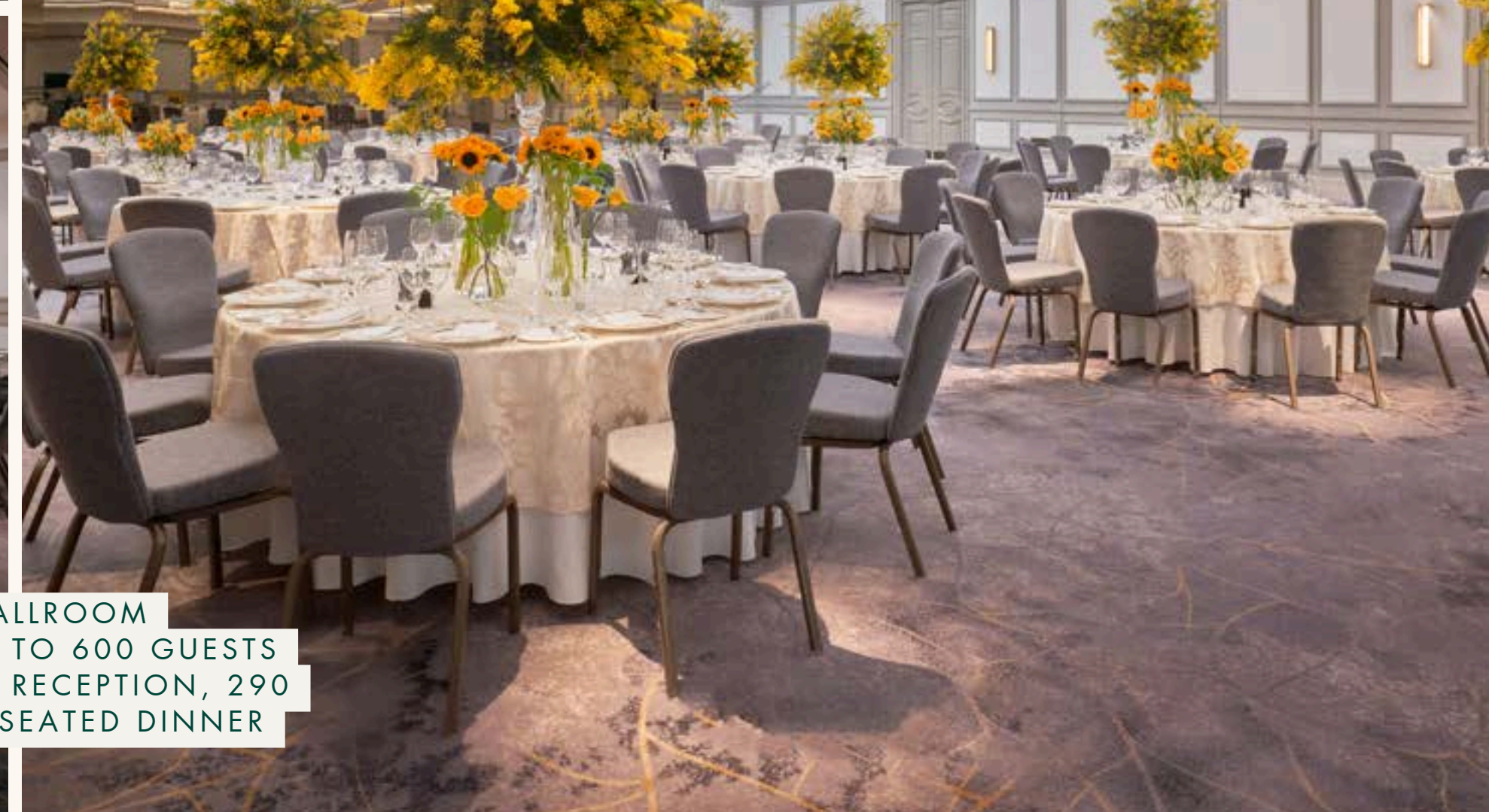
THE BALLROOM CAPACITY: UP TO 600 GUESTS FOR COCKTAIL RECEPTION, 290 GUESTS FOR SEATED DINNER