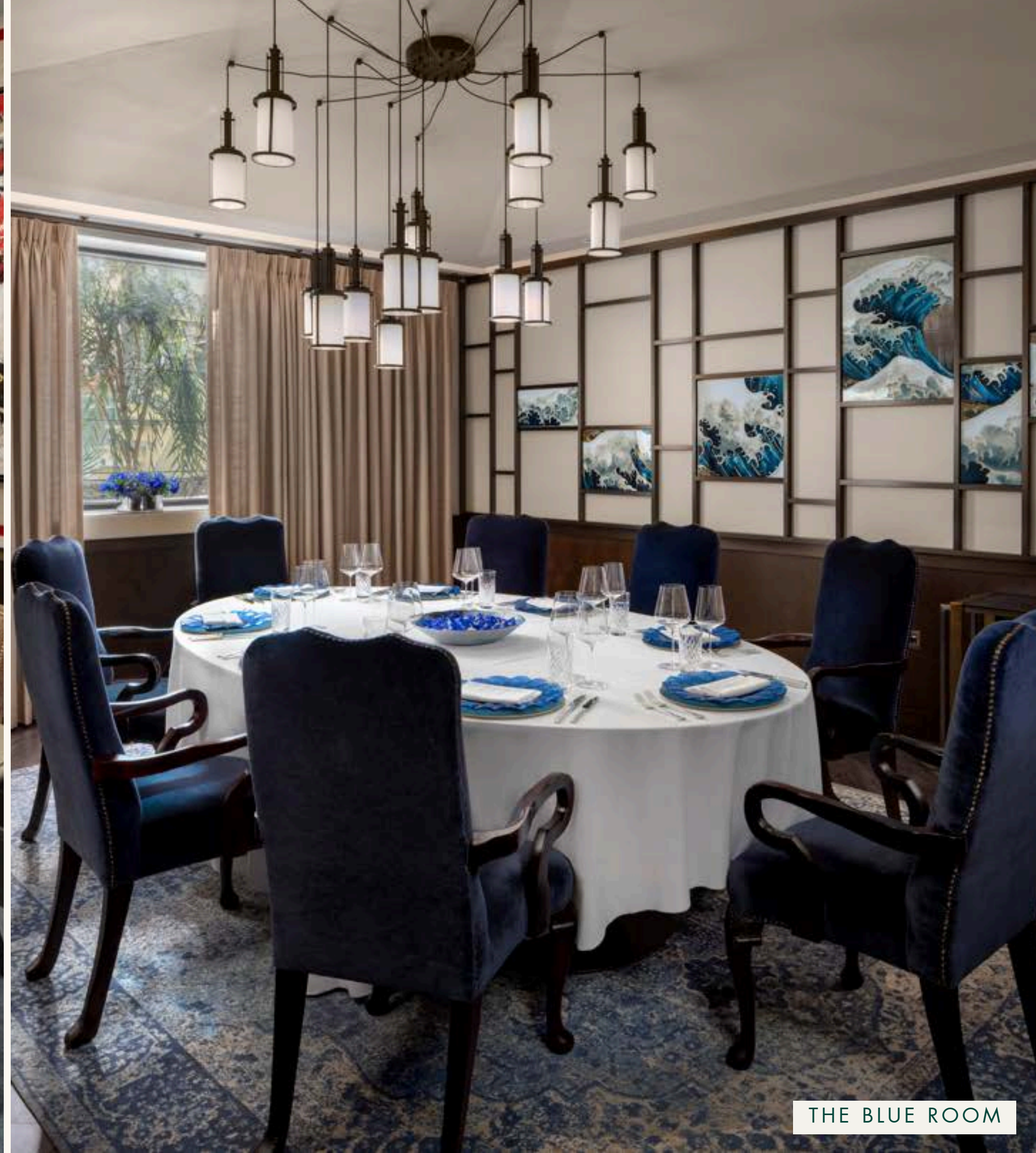
THE BLUE ROOM