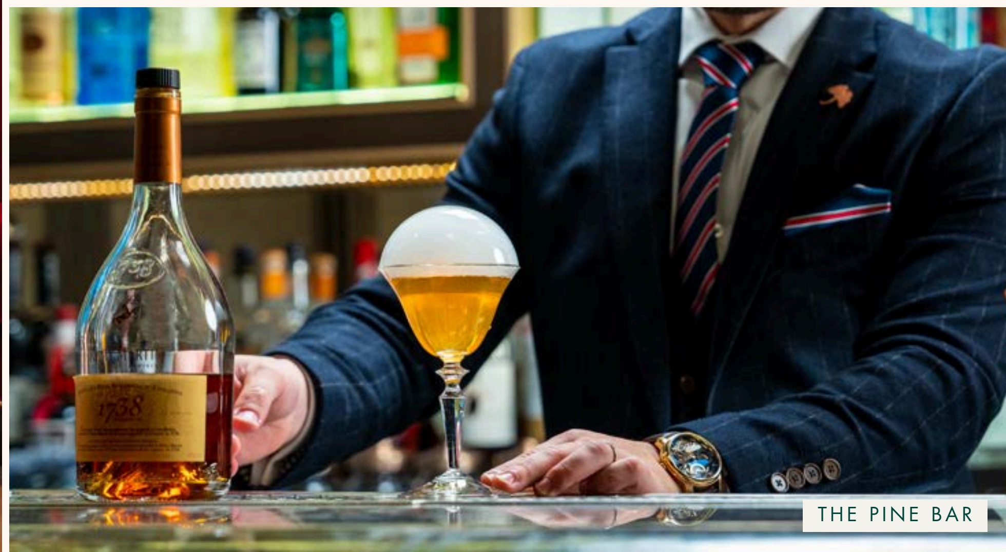
THE PINE BAR