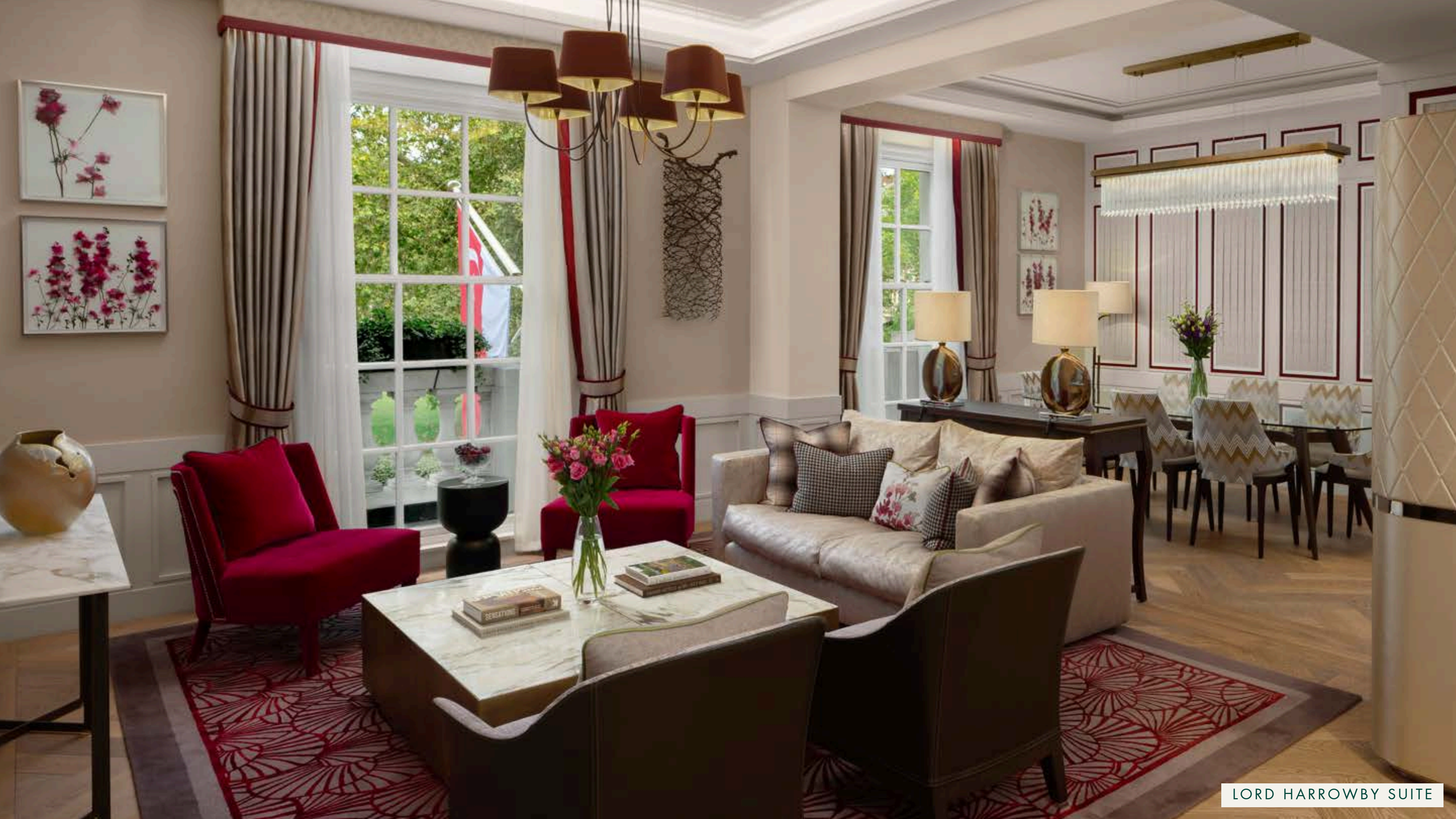
LORD HARROWBY SUITE