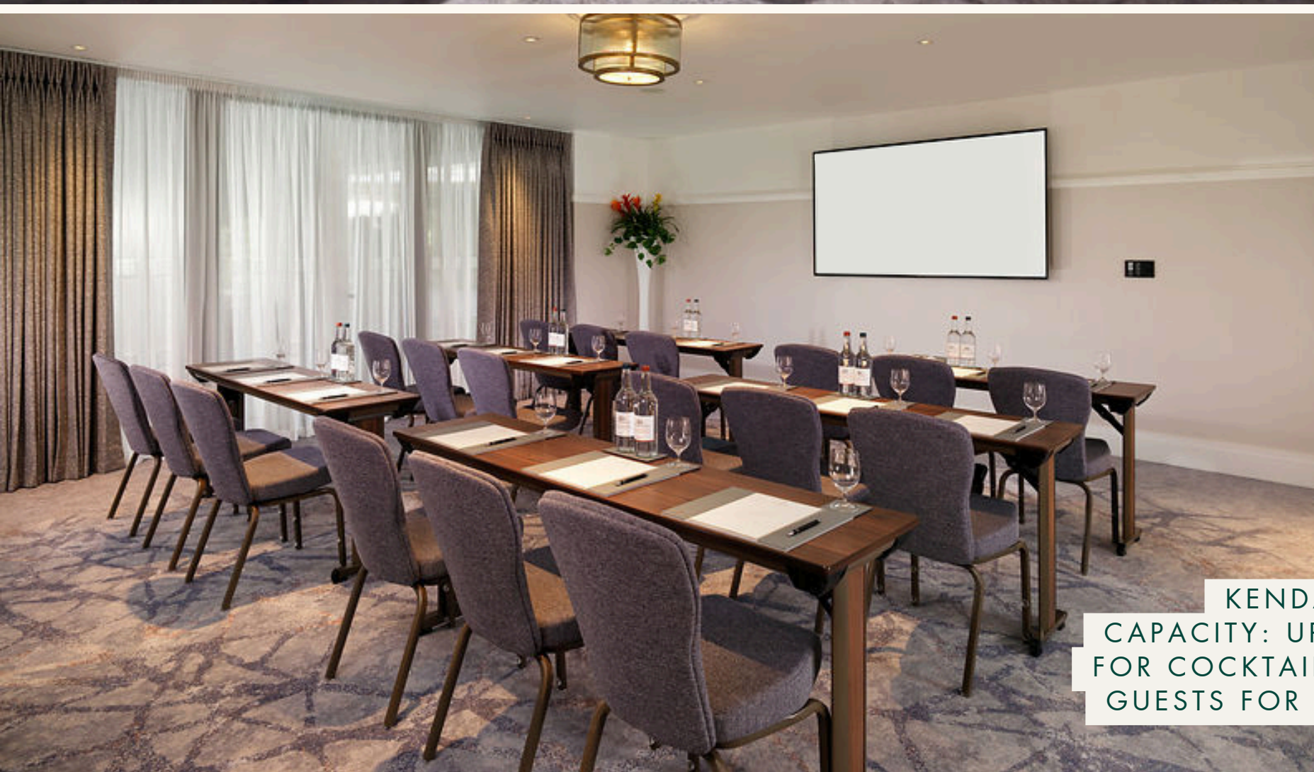
KENDAL SUITE CAPACITY: UP TO 30 GUESTS FOR COCKTAIL RECEPTION, 24 GUESTS FOR SEATED DINNER