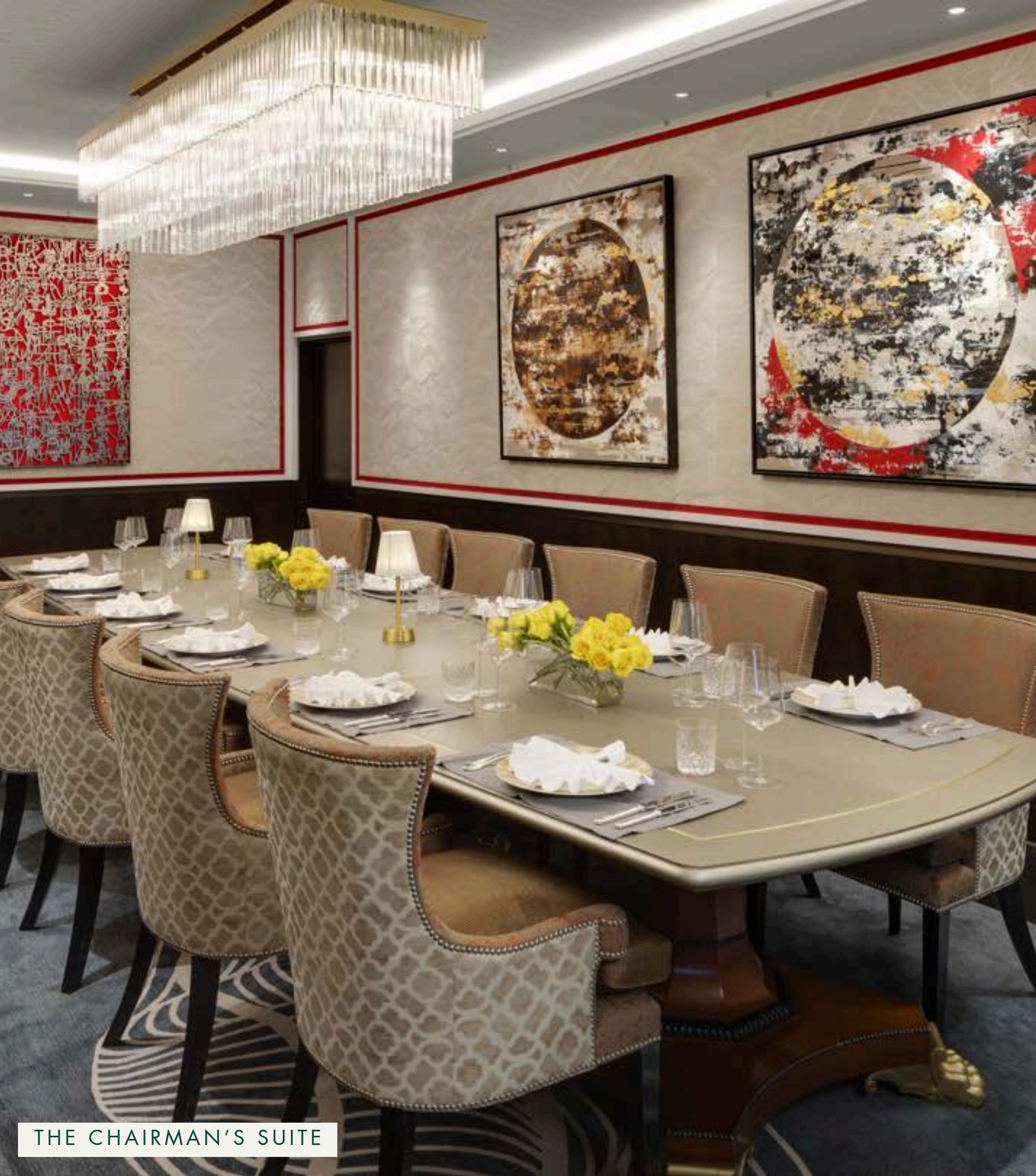
THE CHAIRMAN'S SUITE