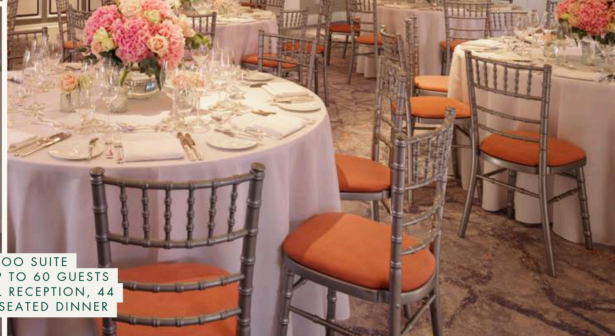
WATERLOO SUITE CAPACITY: UP TO 60 GUESTS FOR COCKTAIL RECEPTION, 44 GUESTS FOR SEATED DINNER