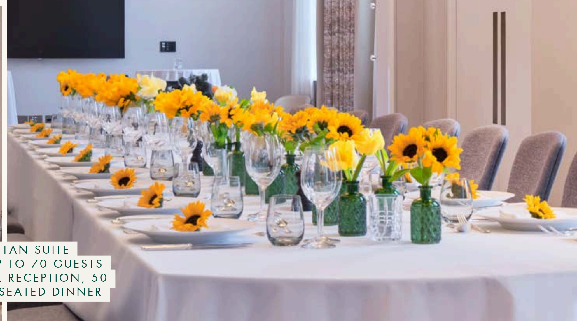
MANHATTAN SUITE CAPACITY: UP TO 70 GUESTS FOR COCKTAIL RECEPTION, 50 GUESTS FOR SEATED DINNER