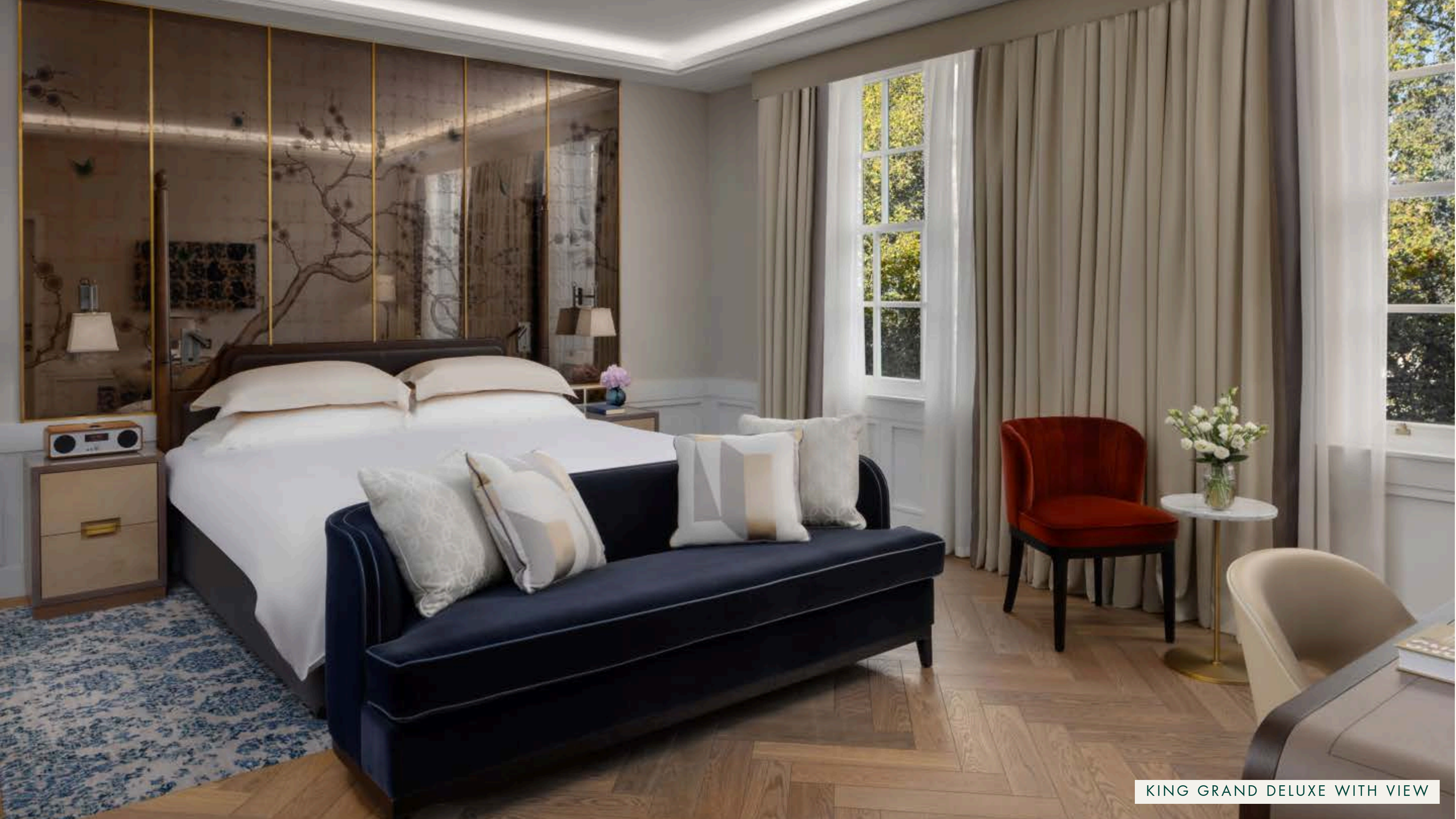
KING GRAND DELUXE WITH VIEW