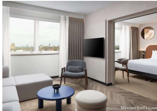
Mercure Earl's Court