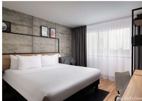
Ibis Earl's Court