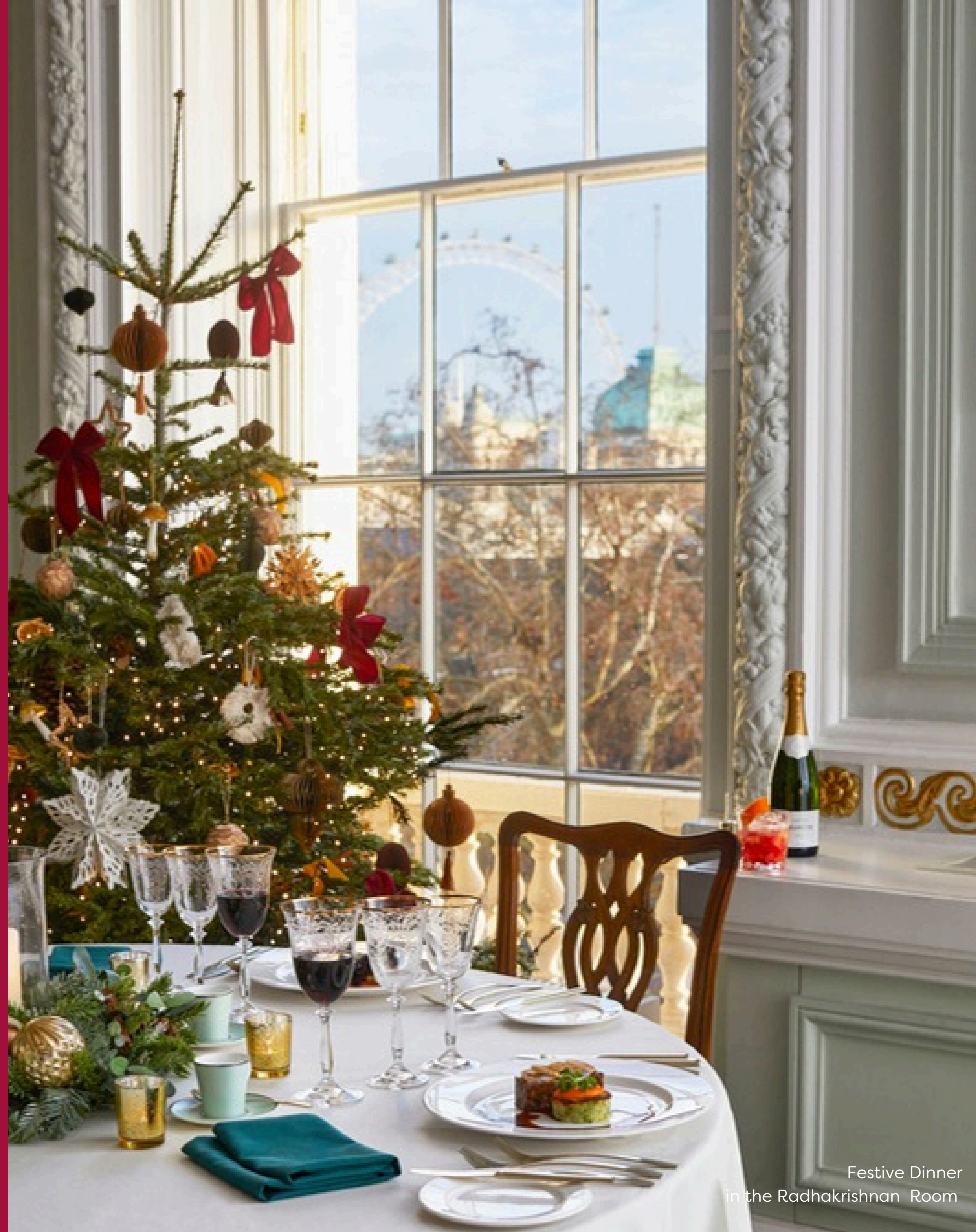
Festive Dinner in the Radhakrishnan Room

We are dedicated to making our clients' events a success. Whether they know what they are looking for, or are in need of inspiration, we are able to accommodate their needs. Our team understands entertainment, and we pride ourselves on working with the very best acts that the industry has to offer.