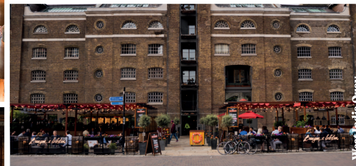
West India Quay