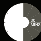
From Gatwick Airport