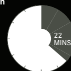
From London Waterloo to Weybridge Station