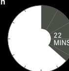
From London Waterloo to Weybridge Station