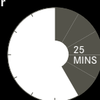
From Heathrow Airport