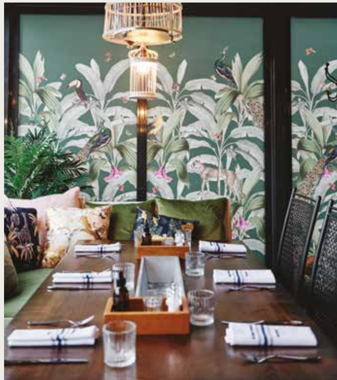
TOP: THE DINING ROOM BOTTOM LEFT: THE COURTROOM BOTTOM RIGHT: THE MENAGERIE