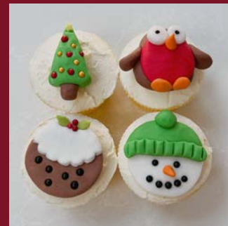
CHRISTMAS CUPCAKE DECOR