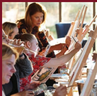
SIP & PAINT