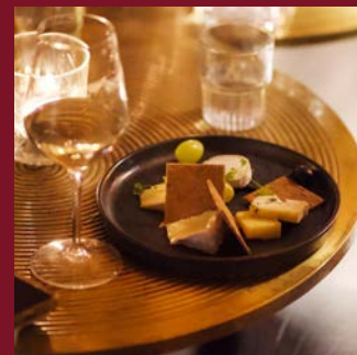
WINE & CHEESE TASTING