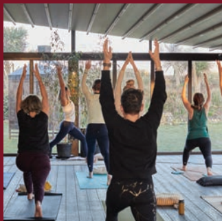
YOGA & PILATES