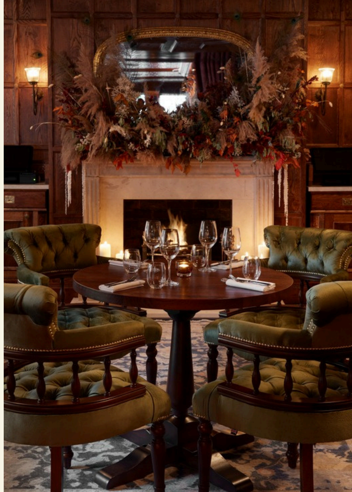
TABLE SERVICE WIFI AVAILABLE PRIVATE ROOM