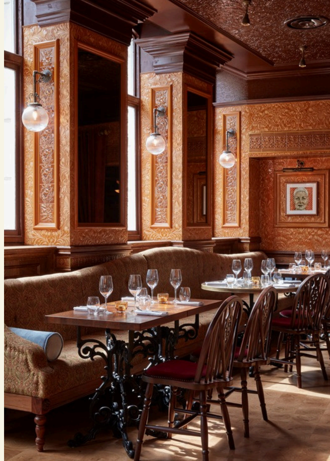
TABLE SERVICE WIFI AVAILABLE