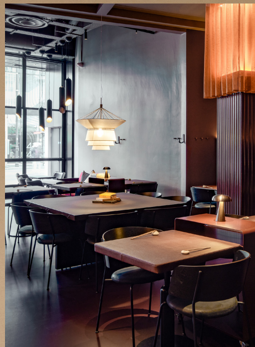
SHOREDITCH 160-220 guests