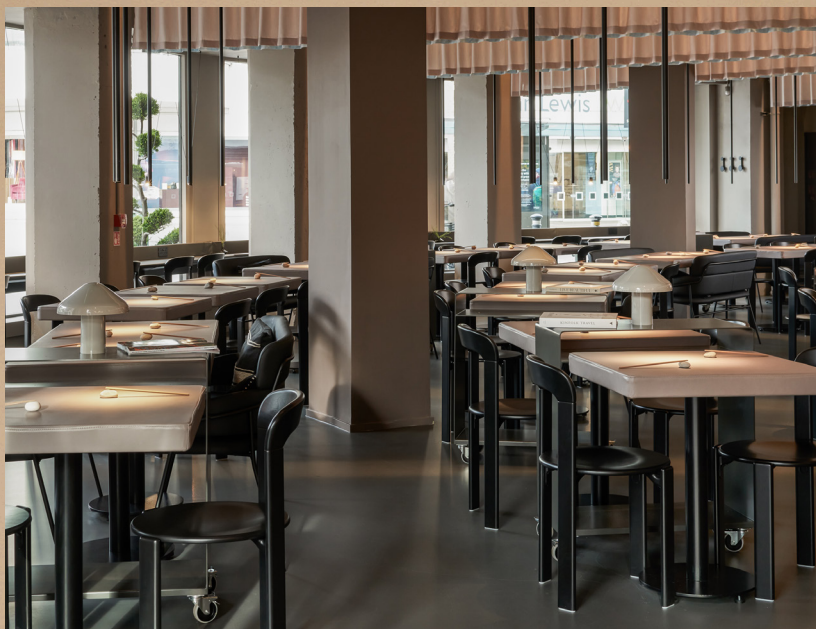
KINGSTON 230-300 guests