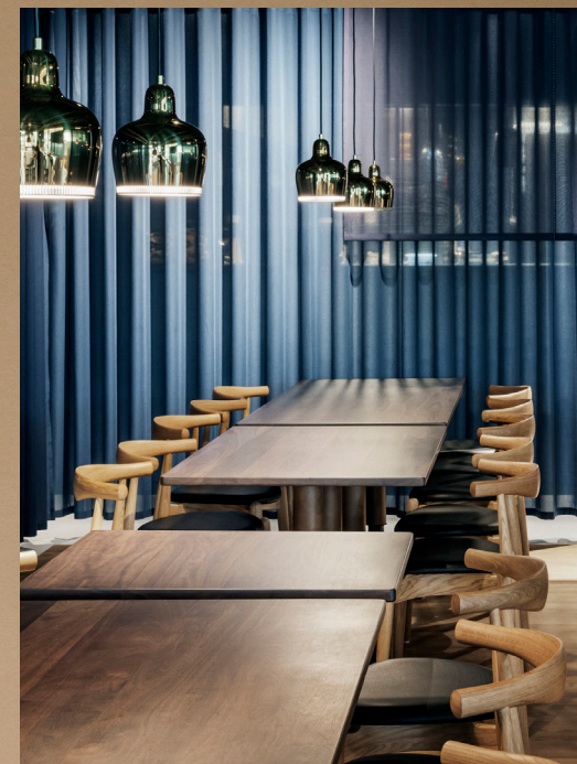
OXFORD 100-150 guests