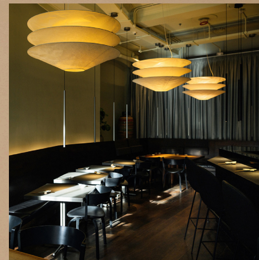
CAMBRIDGE 80-100 guests