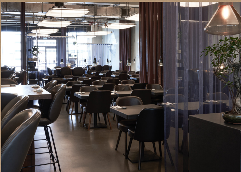
CANARY WHARF 130-160 guests