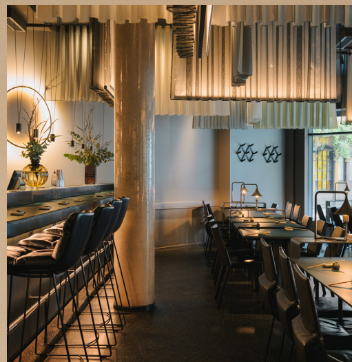
SOHO 100-150 guests