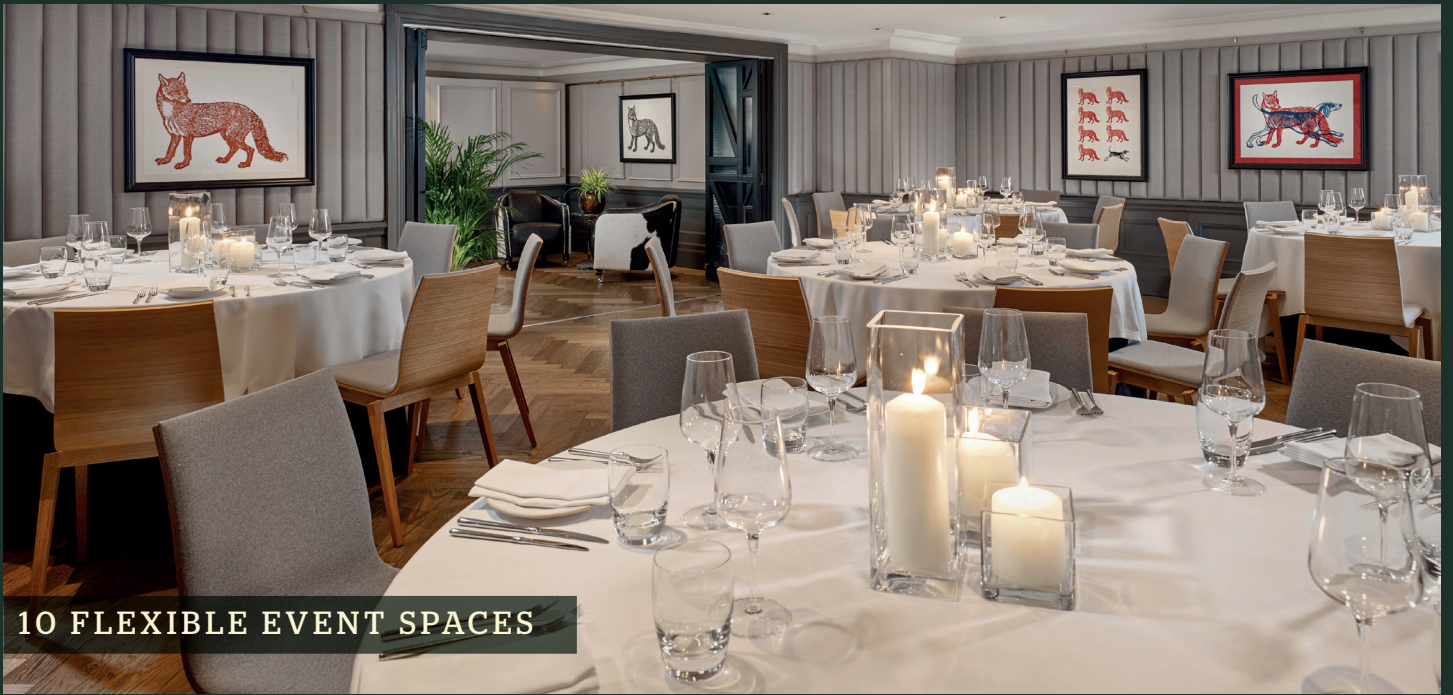
10 FLEXIBLE EVENT SPACES