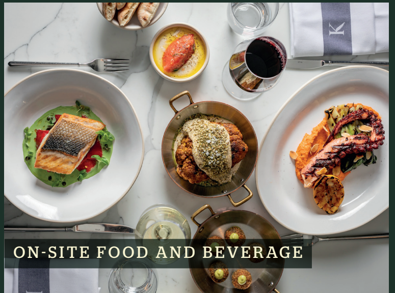
ON-SITE FOOD AND BEVERAGE