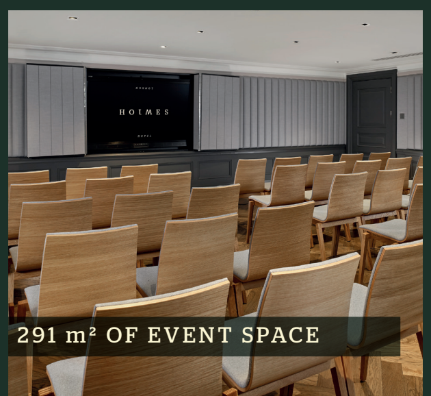
291 m 2 OF EVENT SPACE