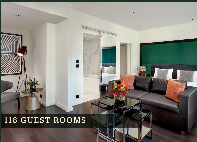
118 GUEST ROOMS