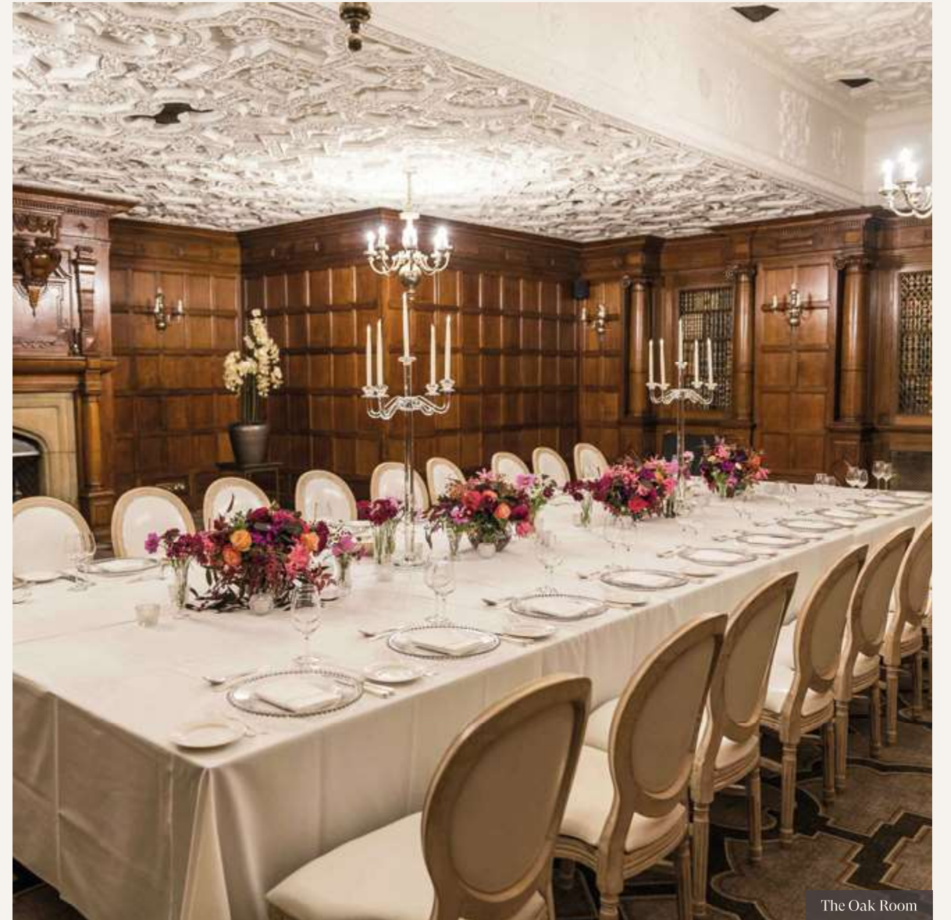
The Oak Room

The Oak Room seating up to 90 guests, panelled in rich solid oak crowned with an ornate plaster cast ceiling based on a 17th Century design.