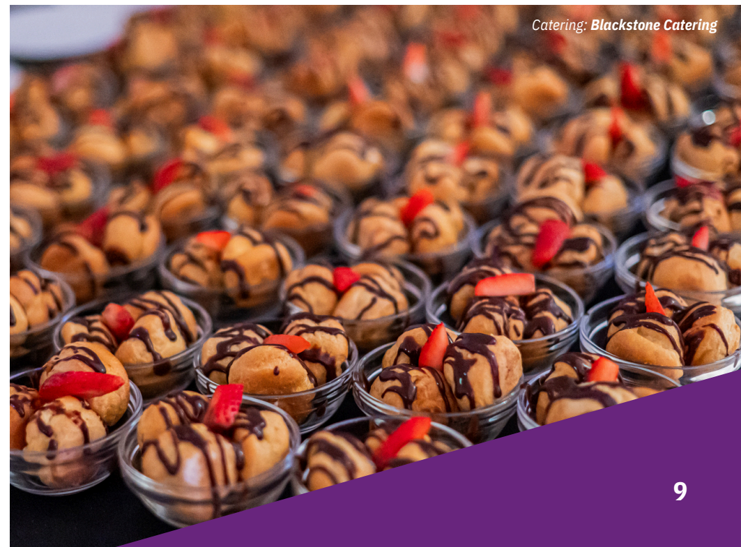
Catering: Blackstone Catering