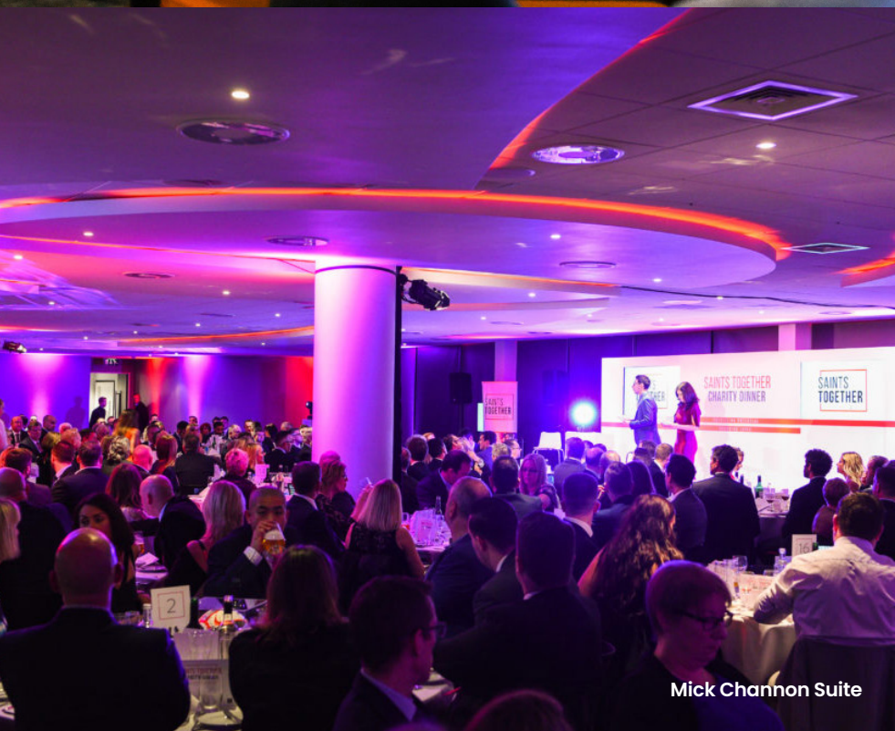
Mick Channon Suite