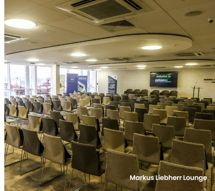
Markus Liebherr Lounge