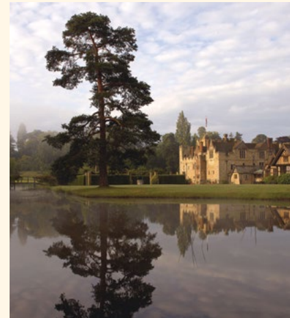
Images: 1 The Guthrie Pavilion, 2 The Tudor Suite, 3 Hever Castle, 4 The Astor Wing