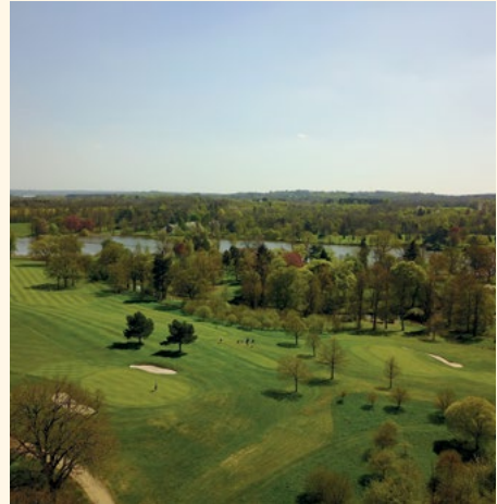
Images 1 & 4: Championship Course, 2 Golf Days, 3 The Waterside Terrace