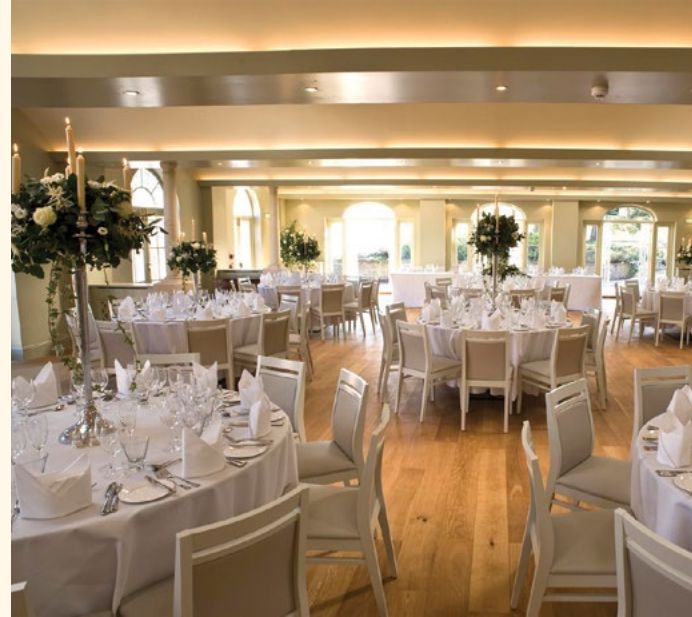
Images: 1 The Loggia, 2 The Guthrie Pavilion, 3 The Guthrie Pavilion, 4 The Guthrie Pavilion