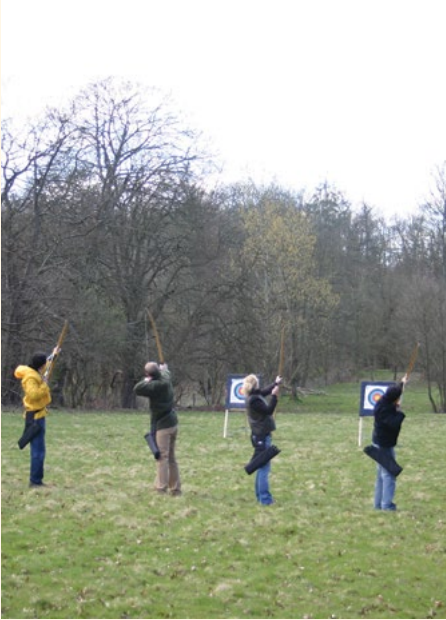
Images: 1 Archery, 2 Apache Rally Cars, 3 Quad Biking