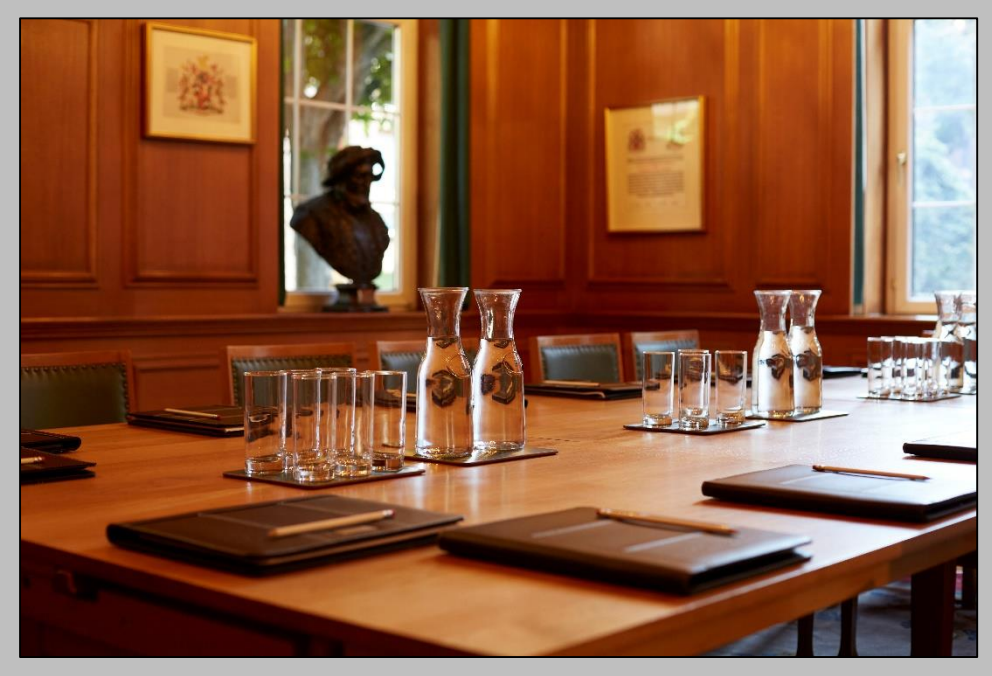
The Livery Room