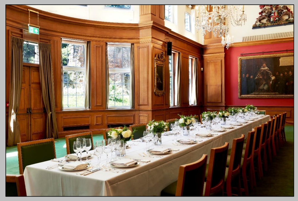
The Front Rooms