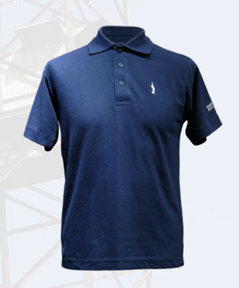
WLSS Polo Shirt £30