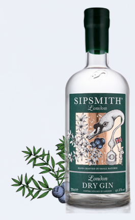
Sipsmith Gin £29