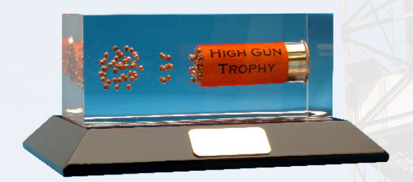
Cartridge & Shot Trophy £155

We have an extensive range of corporate prizes for you to choose from which are available to purchase before your event by pre-order or from our on-site shop.