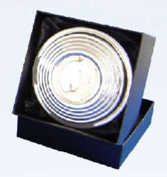
Silver Plated Clay Trophy £95