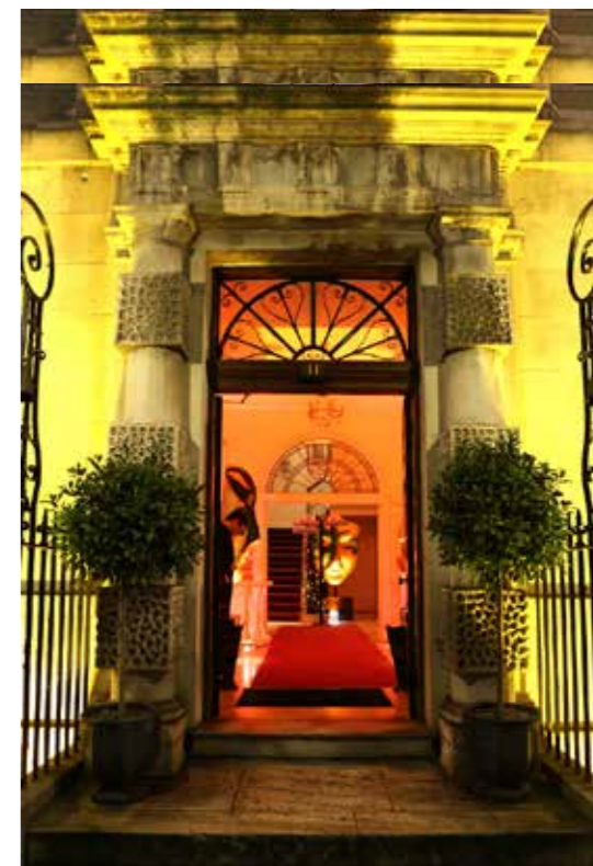
Christmas at No.11 Cavendish Square

Welcome to our Grade II-listed Georgian townhouse, with exceptional classic and modern spaces, fine dining prepared freshly on site, and fantastic theming – perfect for your end-of-year celebration. Christmas is all about letting your hair down and having fun, and what better way to end the year than spending it in an elegant Masquerade Ball with a touch of mystery. We are transforming our spaces with lavish theming, opulent décor and glistening lights – all of which will lead to an unforgettable experience. The attention to detail throughout promises to transport guests to the grandeur of a masquerade ball at a 15th-century manor house. Whether you are looking to host a 300-person drinks reception, a 240-person sit-down dinner or a smaller intimate soirée, our spaces are versatile and unique. Our aim is to make your event a memorable experience for guests from start to finish, so that everyone will be talking about it until Christmas 2025! We look forward to welcoming you to No.11 Cavendish Square and delivering the perfect event.