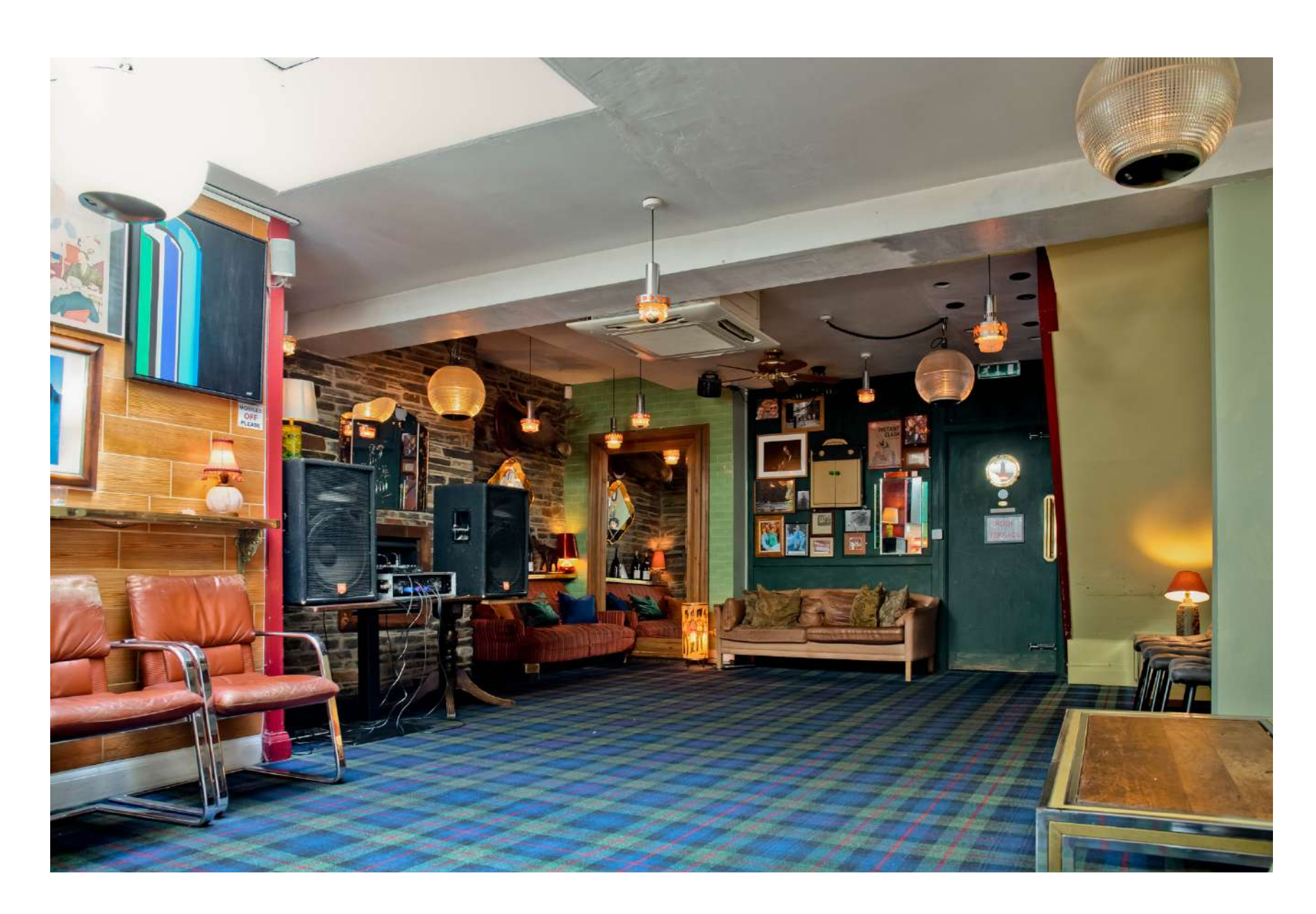
The Back Bar, perfect for speeches, games, dances and live music. Not sure if it's possible? Let us know what you're after and we'll do our best to accommodate.