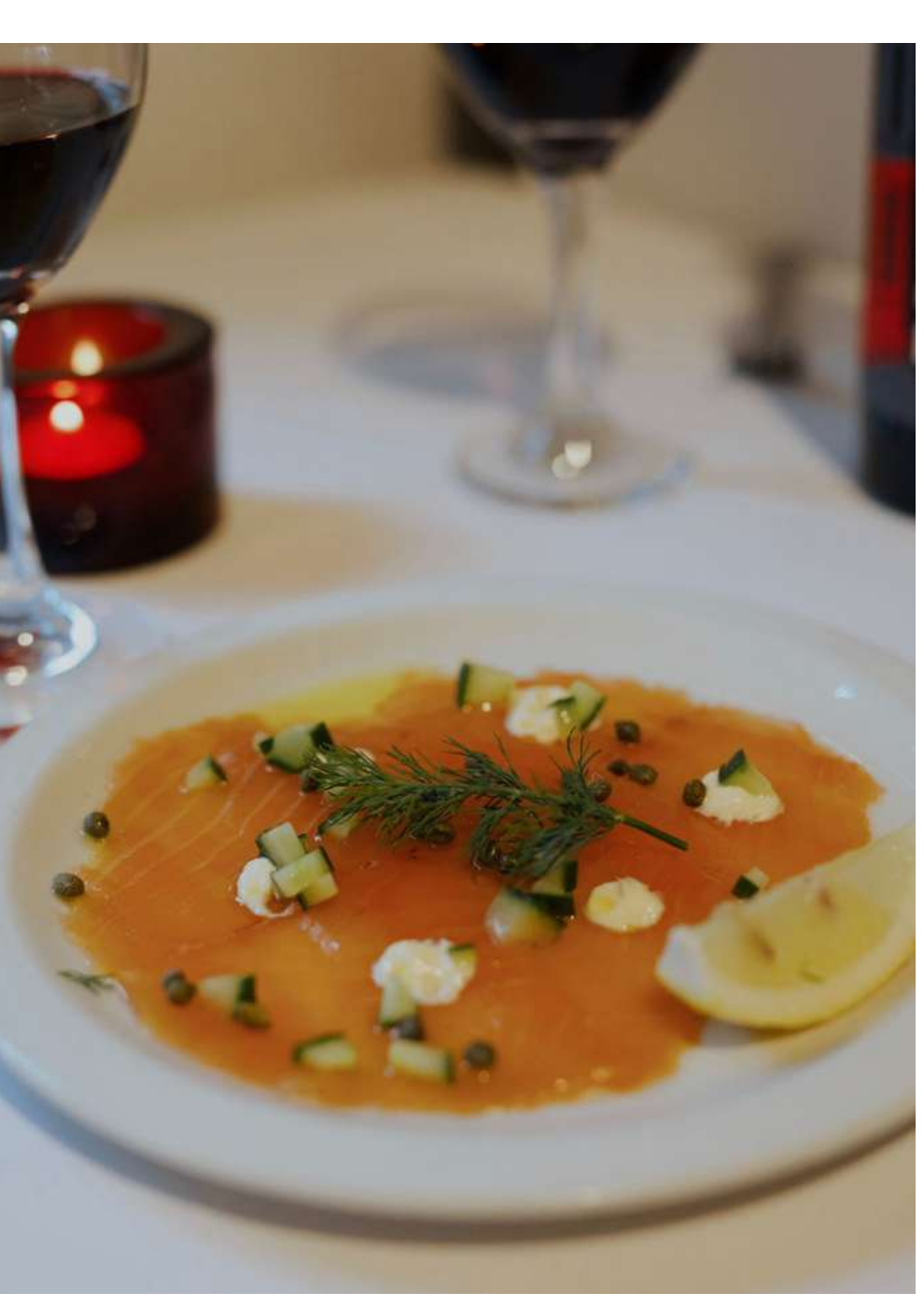
Cured salmon with creme fraiche, capers, dill and cucumber (gf,nf)