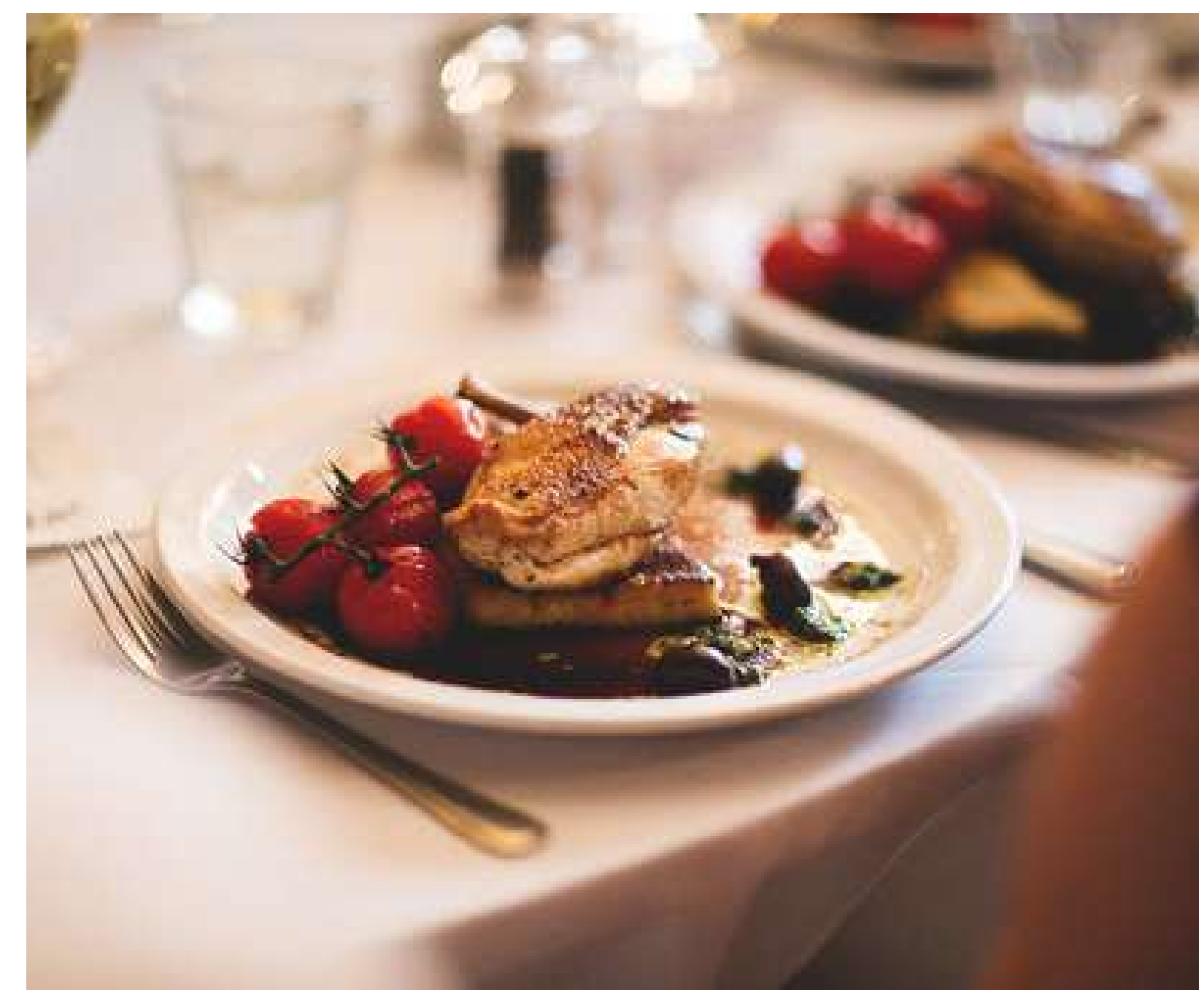
Roasted chicken breast with sage butter, artichoke and salsa verde served with dauphinoise potatoes and seasonal veg (gf)