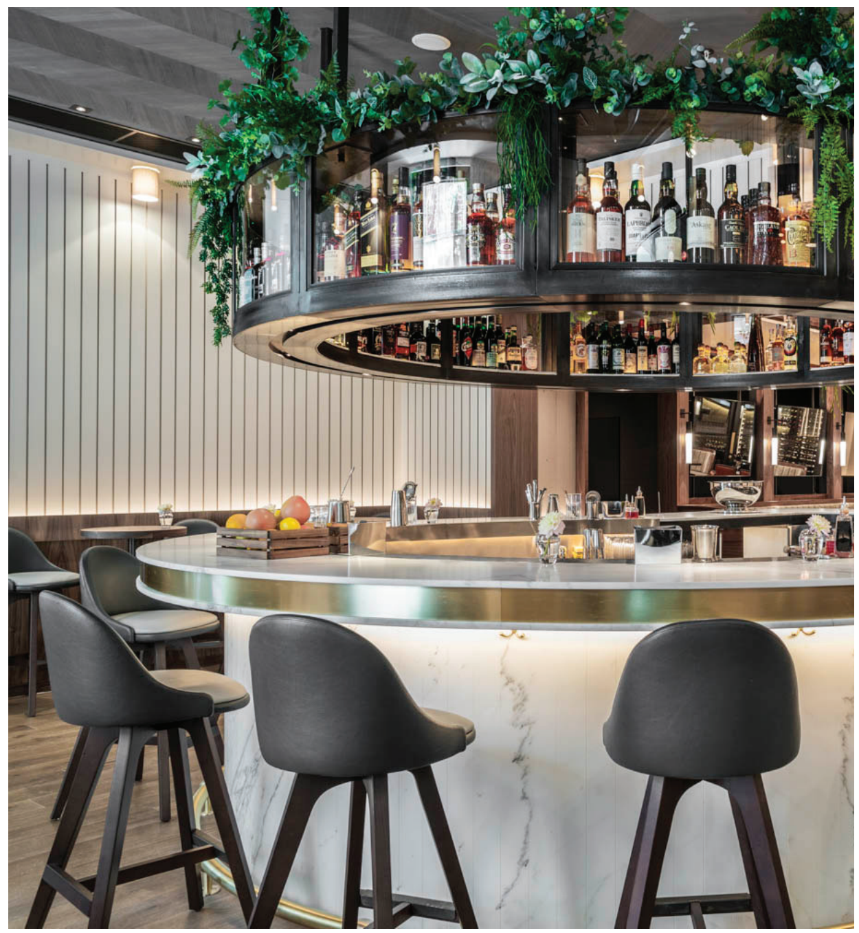
4 Knightsbridge Green | London | SWIX 7QA www.settelondon.co.uk