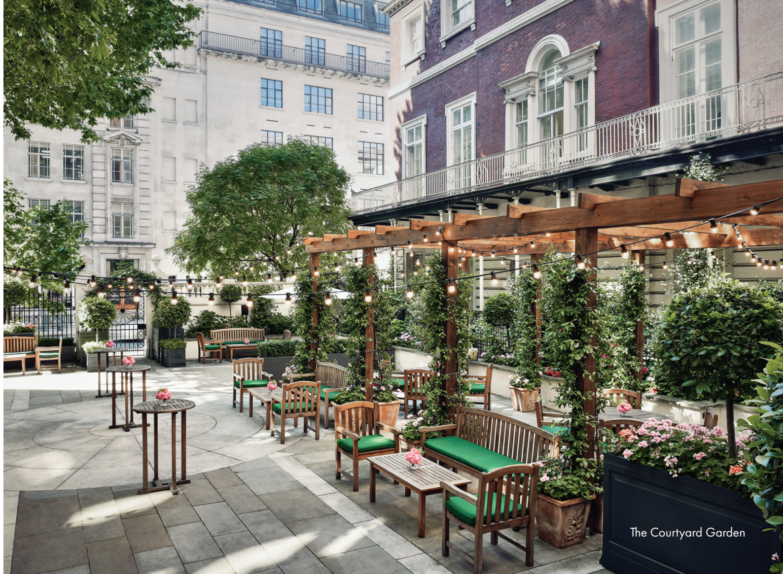
The Courtyard Garden

The south facing garden creates the perfect setting for a fun and memorable event that you and your guests can enjoy.