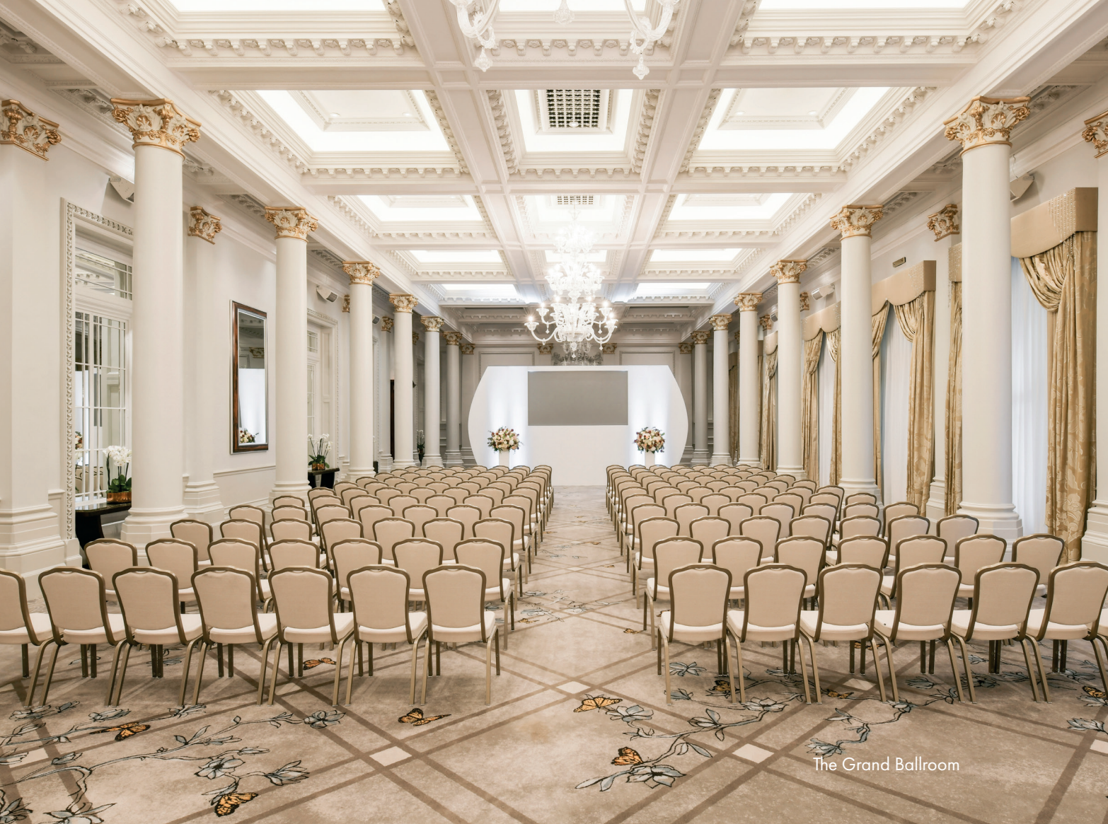
The Grand Ballroom