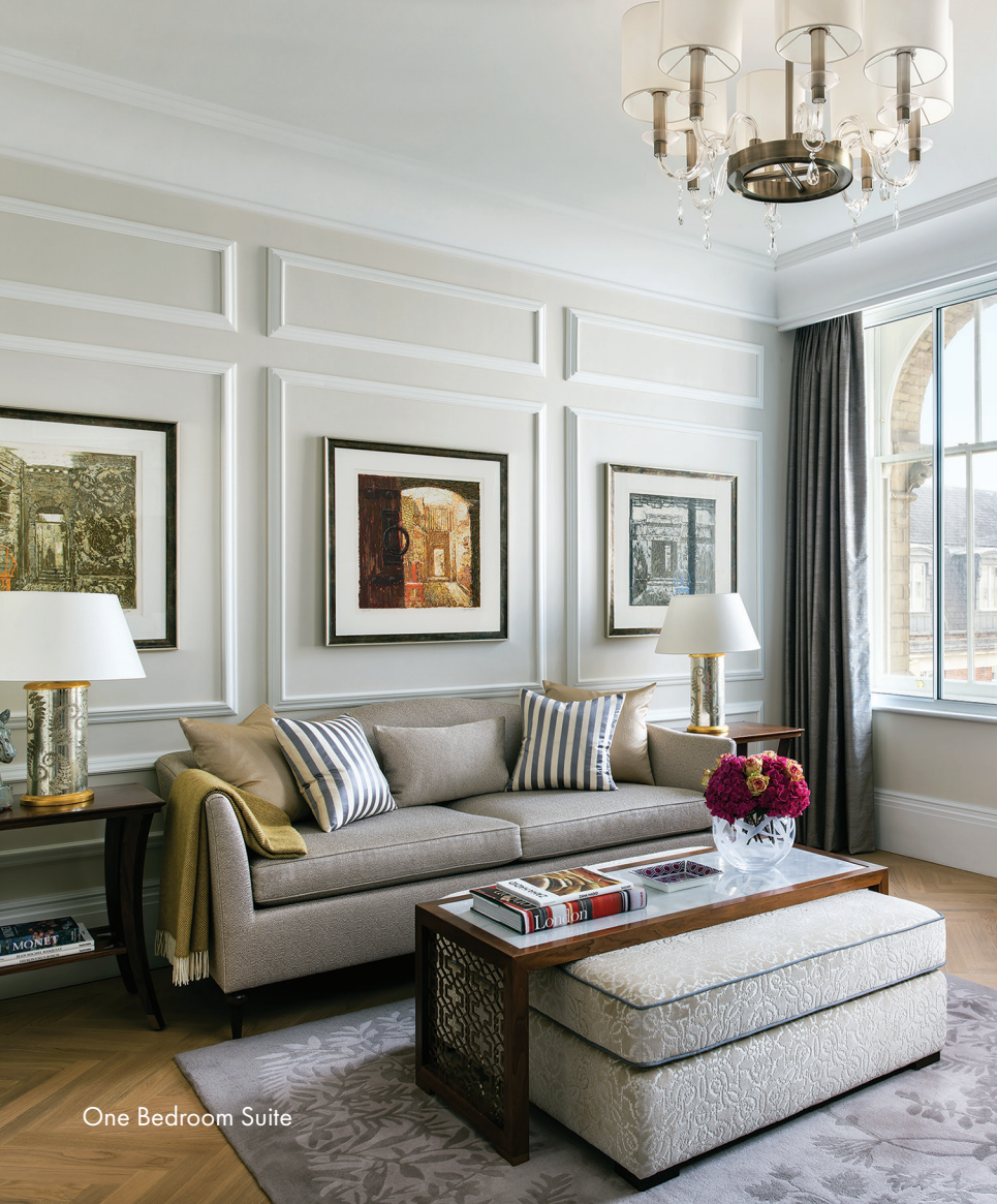
One Bedroom Suite