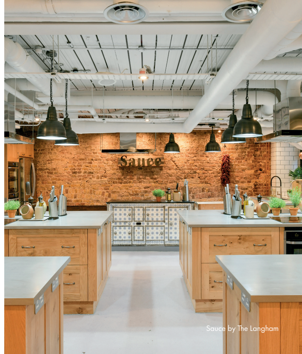
Sauce by The Langham

Sauce is available for group classes of 12 cooking individually, or 24 in pairs as well as for dry hire. It comes with The Pantry dining room or The Conservatory for larger gatherings.