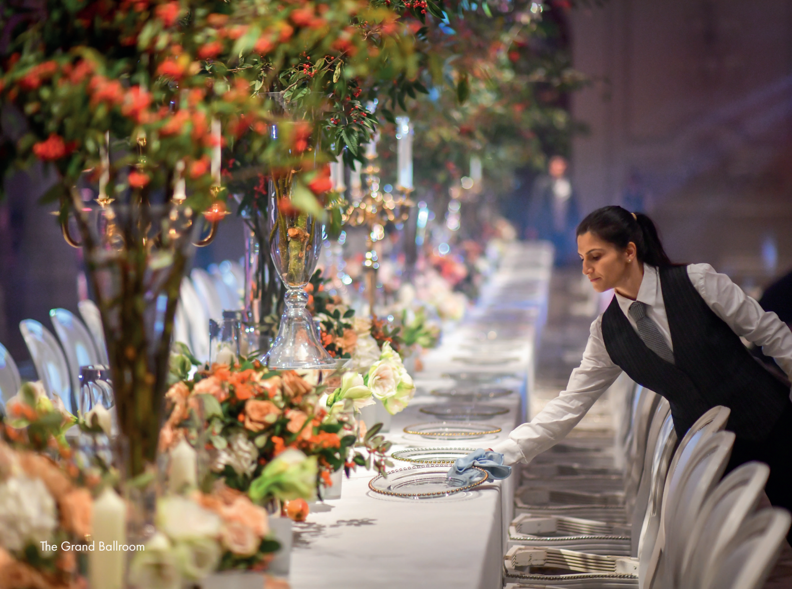
The Grand Ballroom