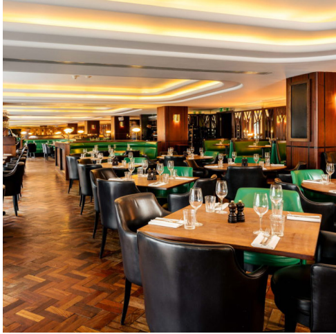
Air Street W1J 0AD