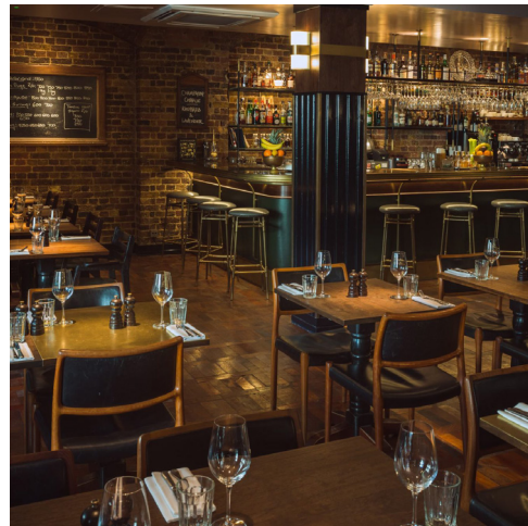
Spitalfields E1 6BJ

All our restaurants are available for full hire. To enquire, please email events@thehawksmoor.com