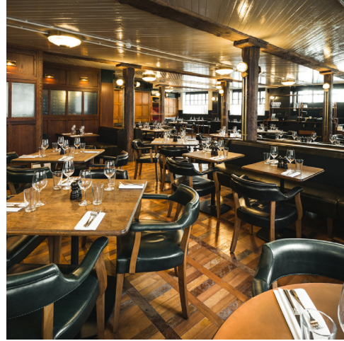
Borough SE1 9AQ