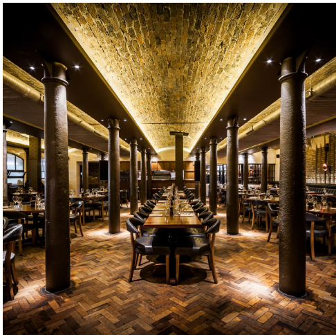
Seven Dials WC2H 9JG