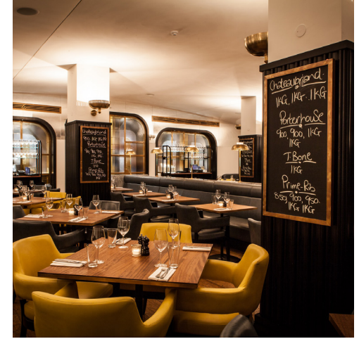
Knightsbridge SW3 2AL