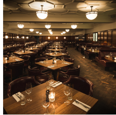
Guildhall EC2V 5BQ