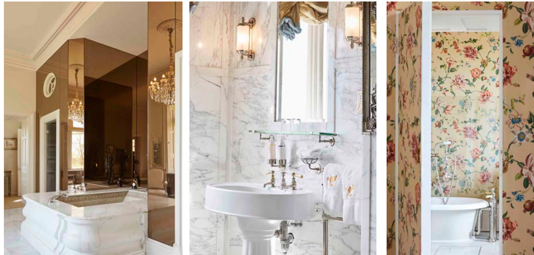
Left page: Diamond (top), Golden Topaz (bottom left) and Pearl (bottom right) Right page: (from left to right) En suite bathrooms for the Diamond, Golden Topaz and Star Ruby