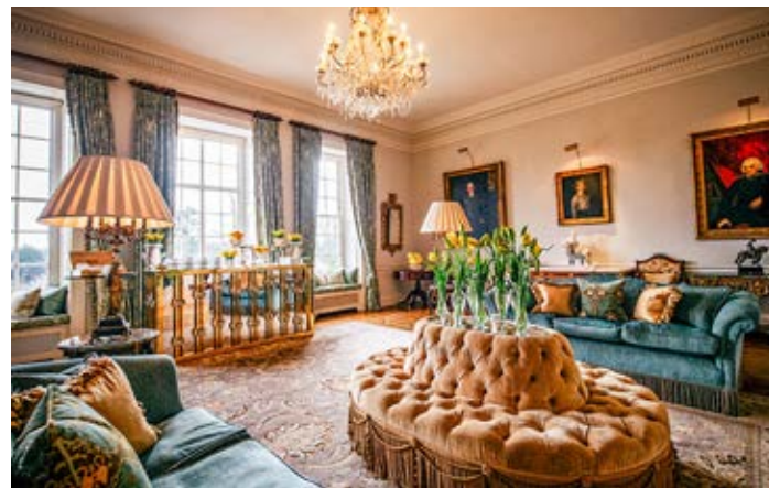
Buck Hall and the Drawing Room (bottom left)