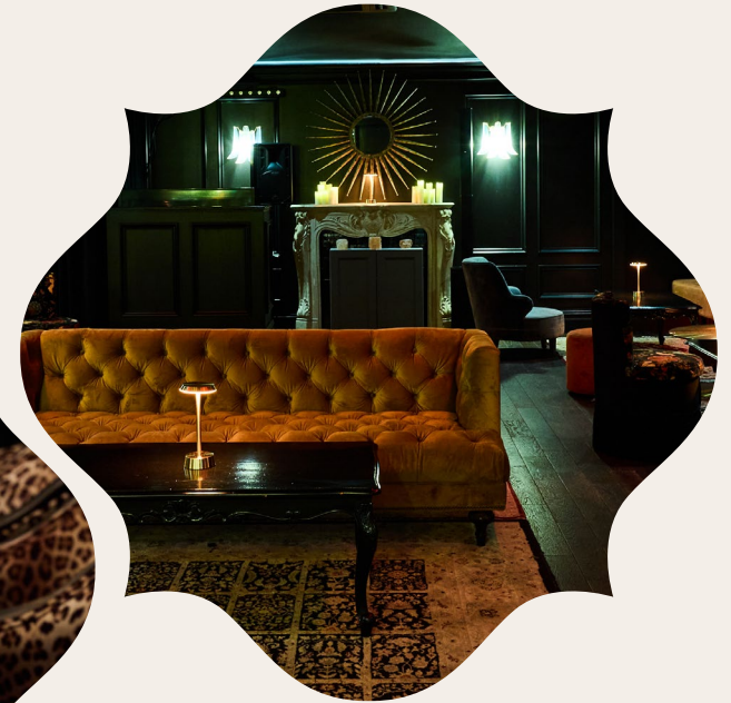
• The Kinnaird Lounge