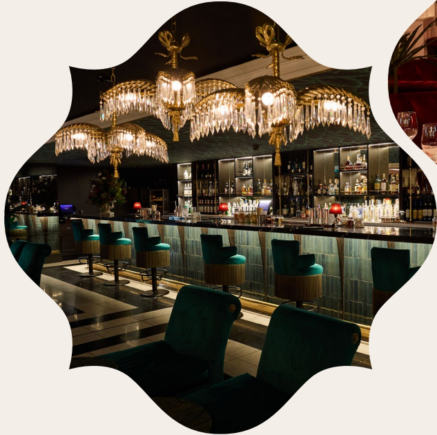
• Bar Space