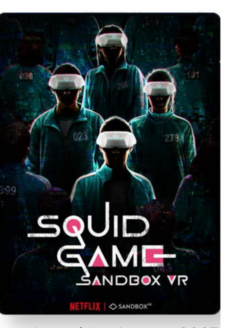
Launching Autumn 2023

"The best entertainment on Earth" - METRO