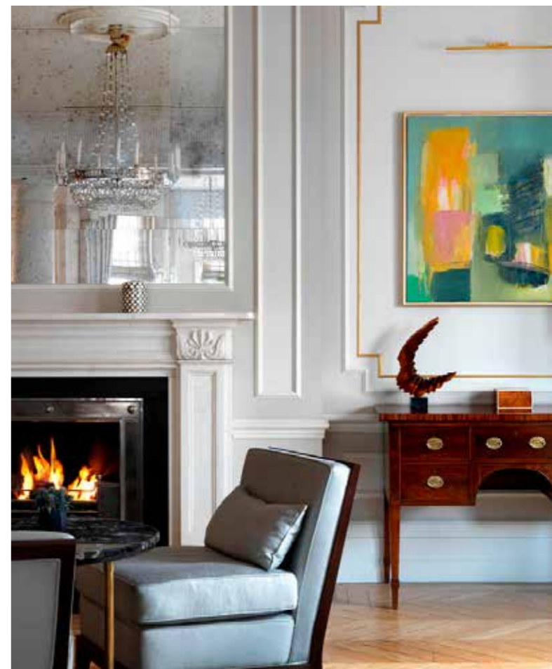
The natural charm of the hotel's Drawing Rooms provides the ultimate backdrop for Afternoon Tea while Townhouse provides a stylish setting for lunch and dinner.