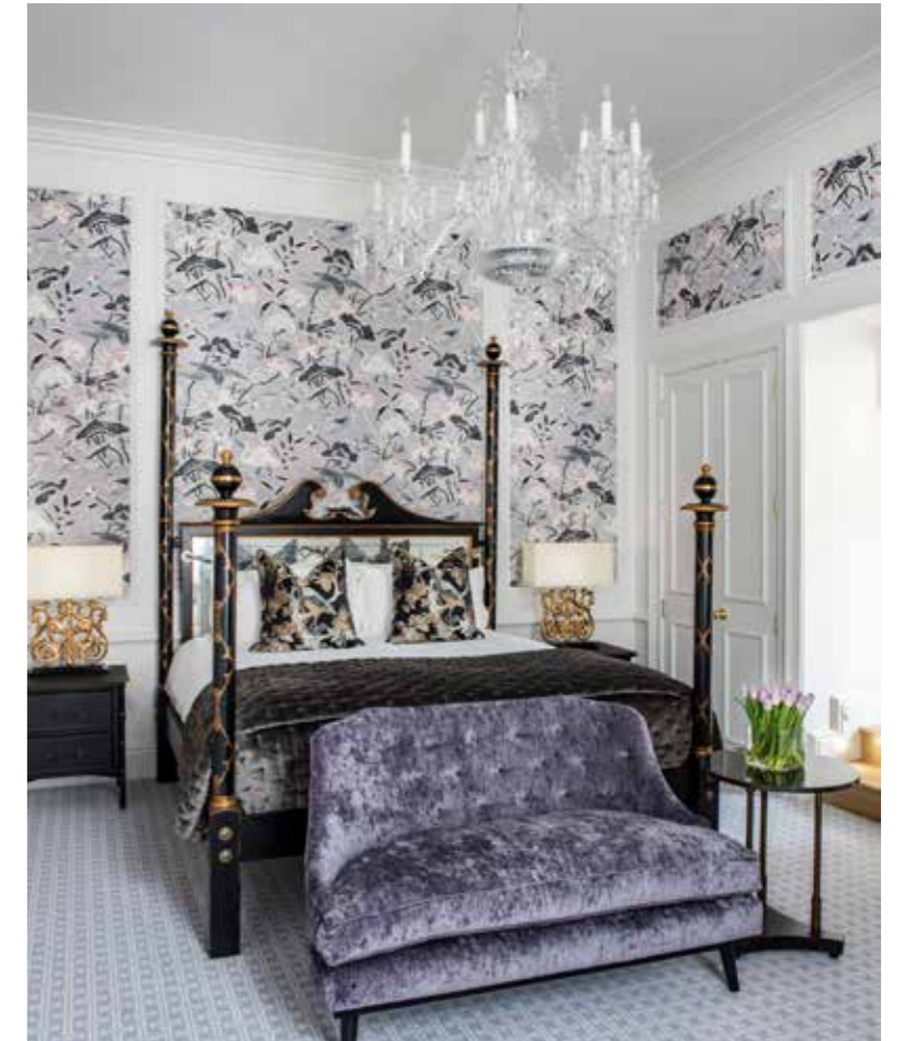
An exquisite blend of period charm and modern comfort, The Kensington's 24 suites reflect the epitome of refined luxury set within the timeless glamour of London's leafy museum district.