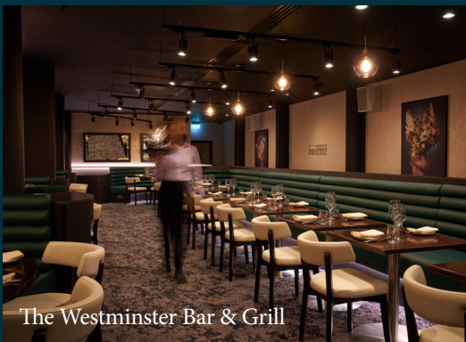
The Westminster Bar & Grill

The Westminster Bar & Grill, a modern steakhouse and bar, offering perfectly grilled steaks, expertly prepared sides, and a carefully curated wine list. For those celebrating the most premium of occasions, opt for our private dining room, perfect for hosting friends, family, and colleagues alike. The space is awash with natural daylight, perfect for a spot of lunch, before evoking the exclusive feel of a private members club of an evening.