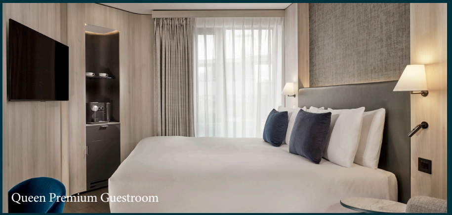
Queen Premium Guestroom