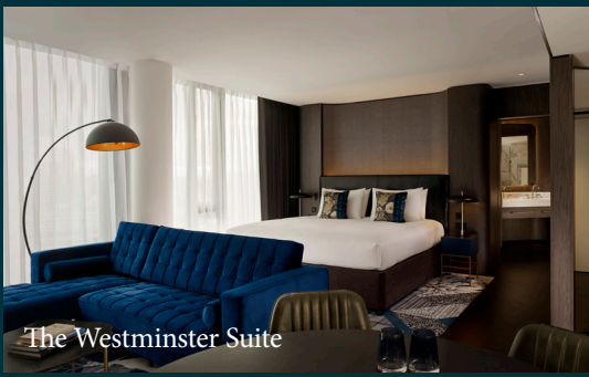
The Westminster Suite