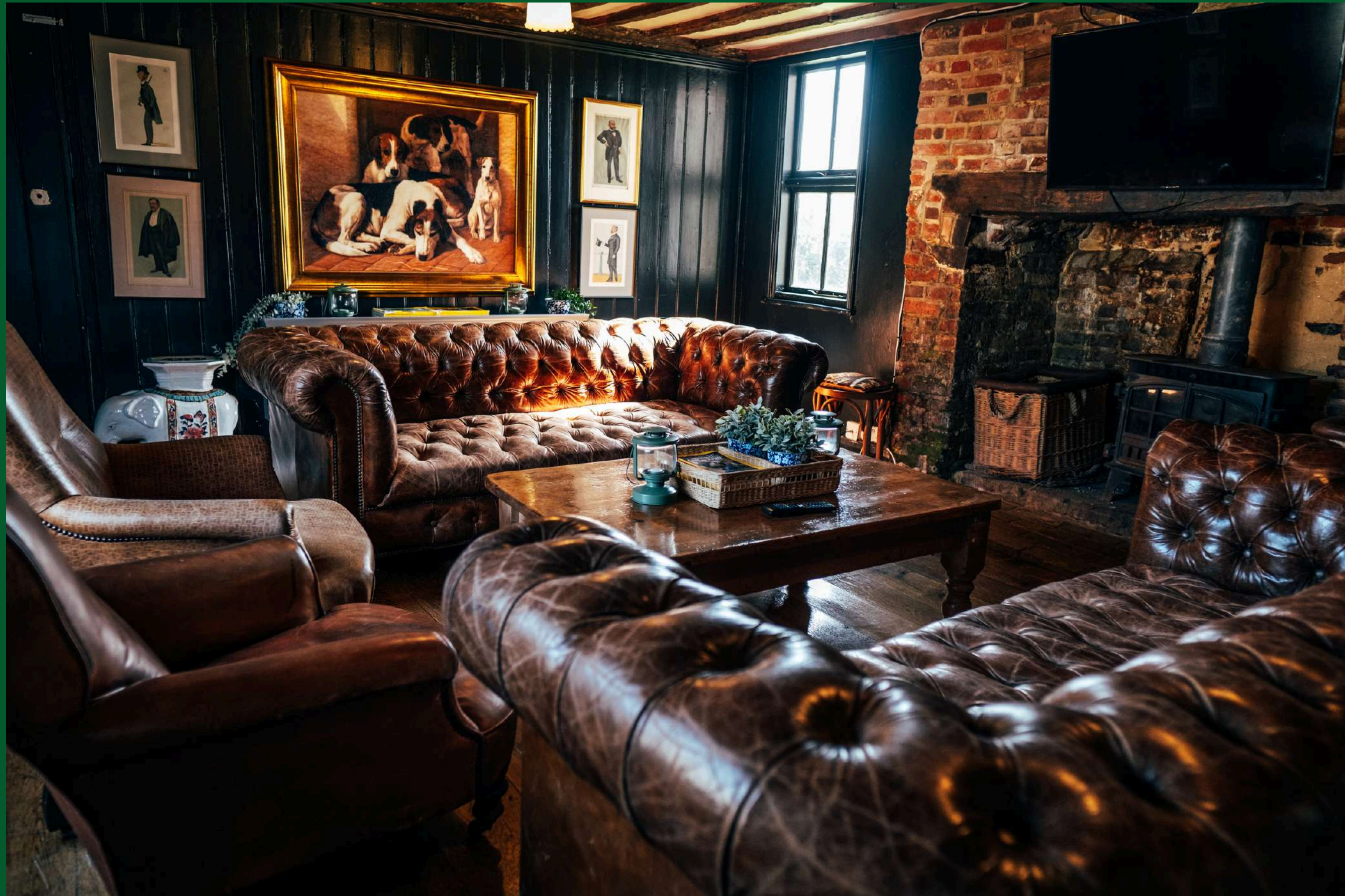
THE PUFFIN - OSEA VILLAGE PUB