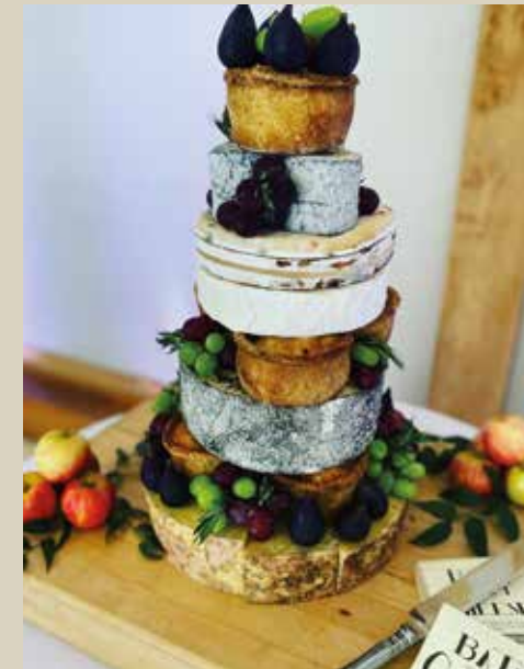
Cheese and Pork Pie Cake