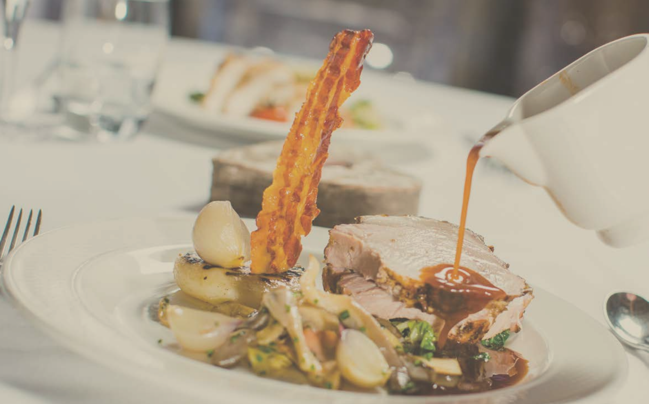
Roast Loin of Pork, Wild Mushrooms, Smoked Bacon Crisp