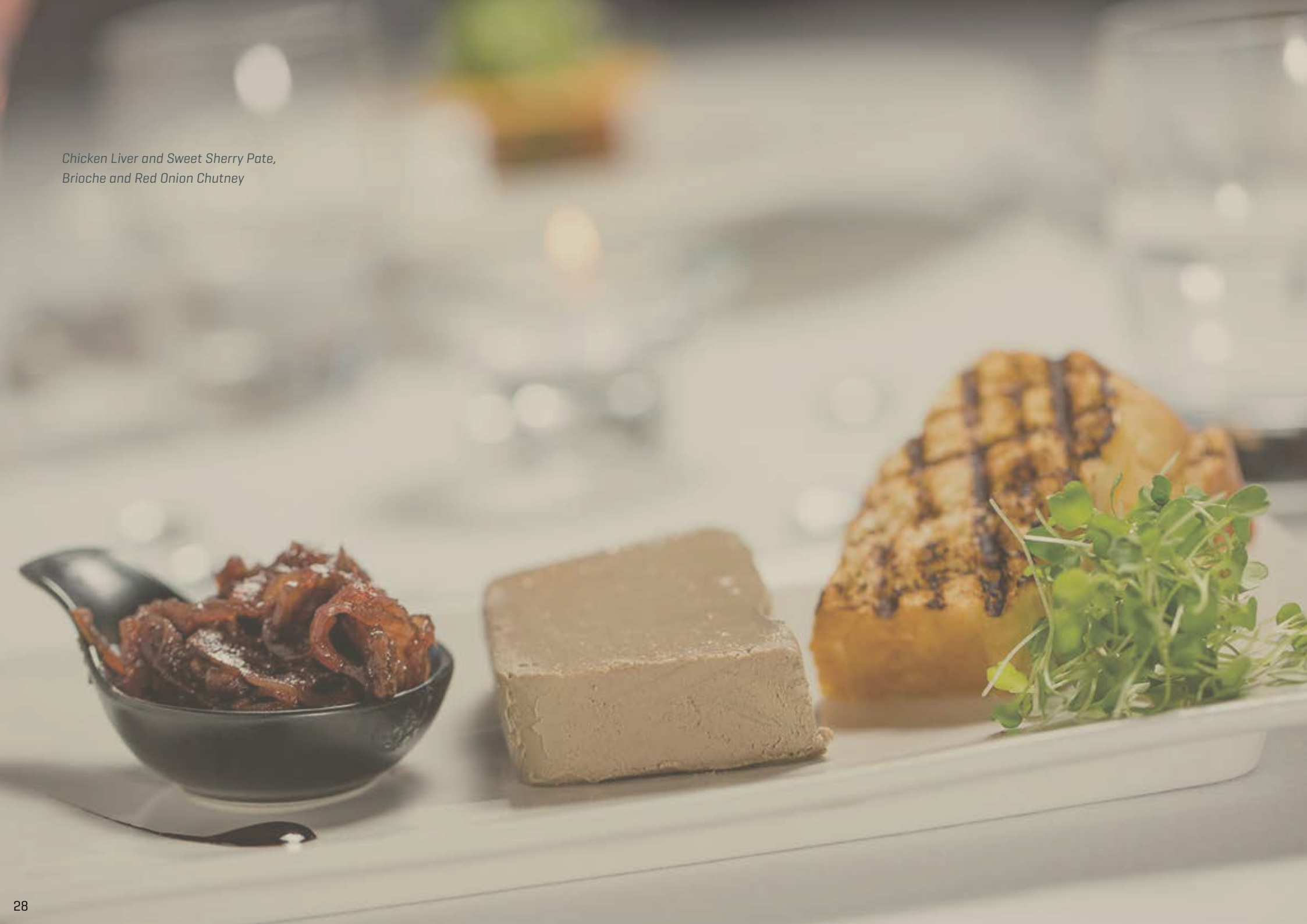
Chicken Liver and Sweet Sherry Pate, Brioche and Red Onion Chutney