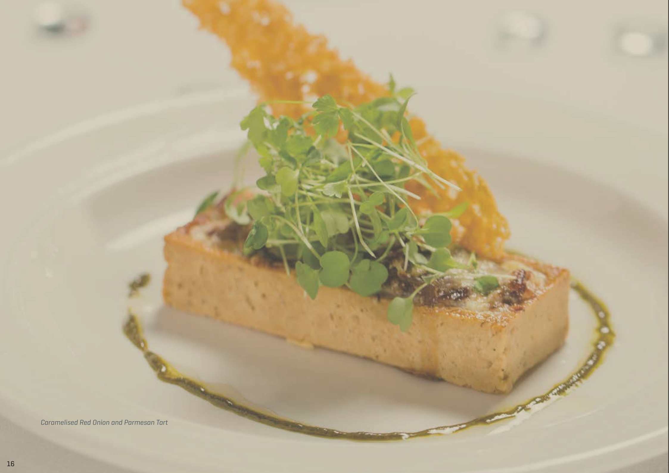
Caramelised Red Onion and Parmesan Tart