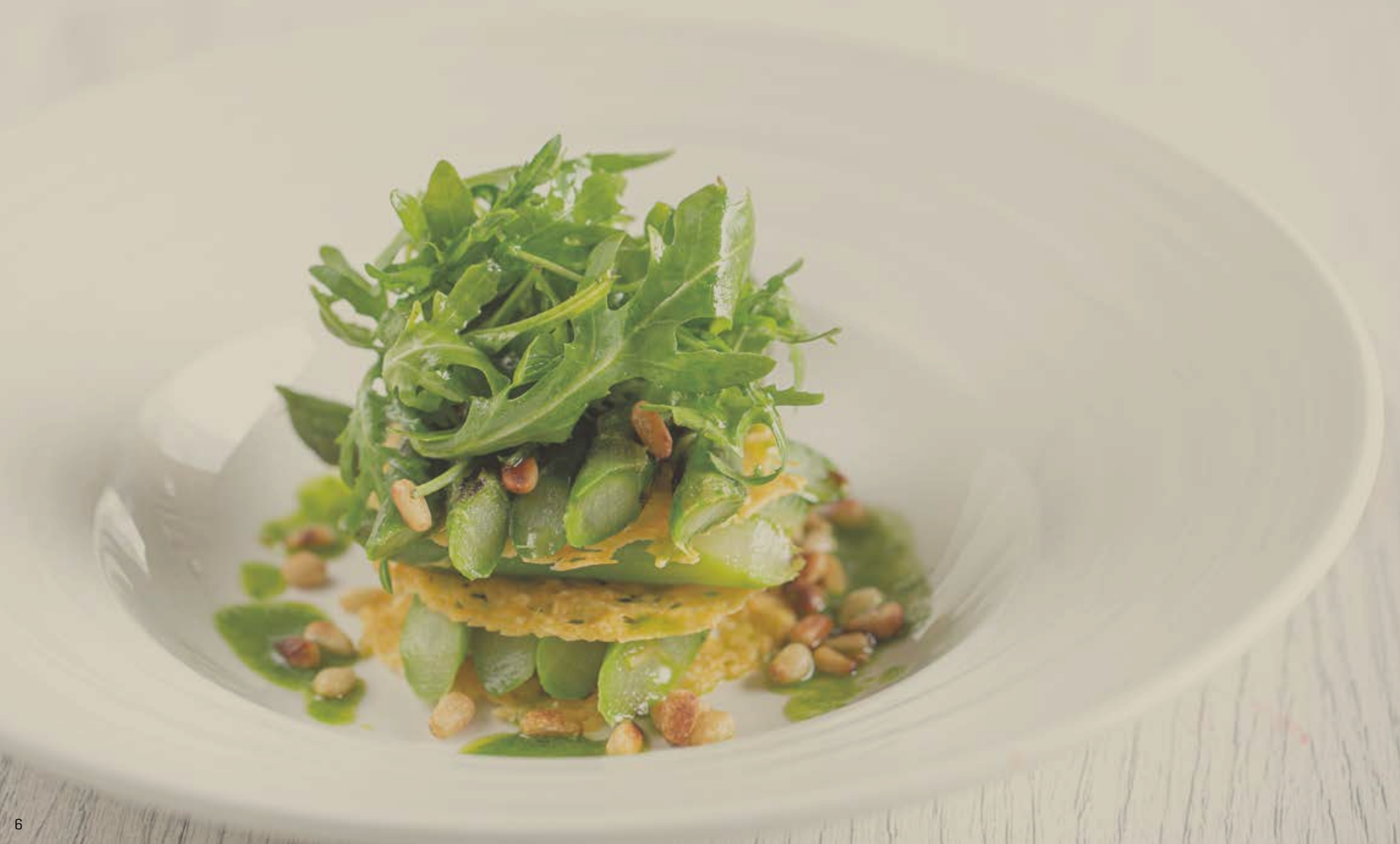
Griddled Asparagus & Parmesan Salad