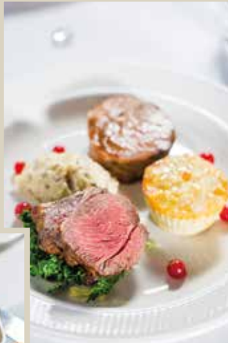
Tasting of Lamb