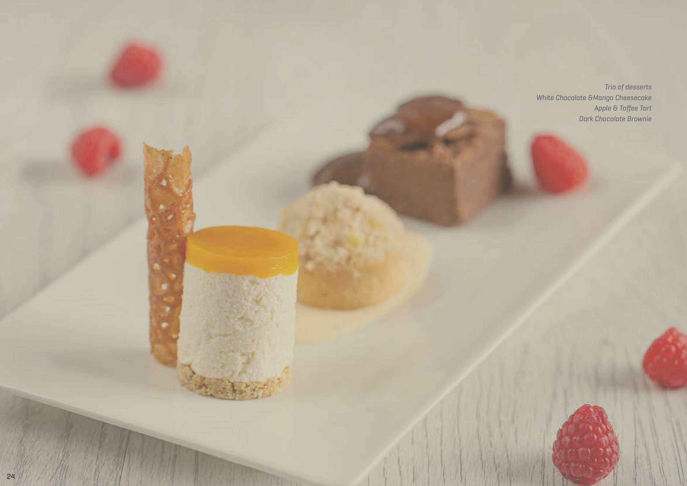
Trio of desserts White Chocolate & Mango Cheesecake Apple & Toffee Tart Dark Chocolate Brownie