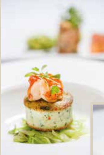
Thai Fish Cake