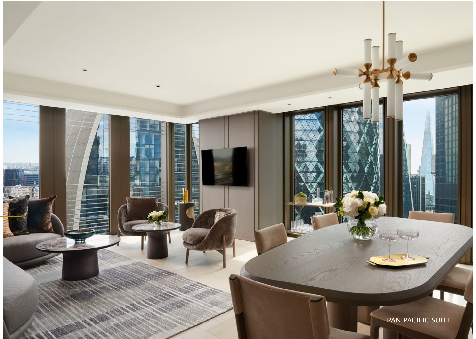
PAN PACIFIC SUITE

Arrive, relax and enjoy tailored modernity with Asian artistic flair in our 237 spacious rooms across 13 floors, 42 luxuriously elegant suites and the Pan Pacific Suite on the 19th floor boasting floor-to ceiling windows with views across the city.