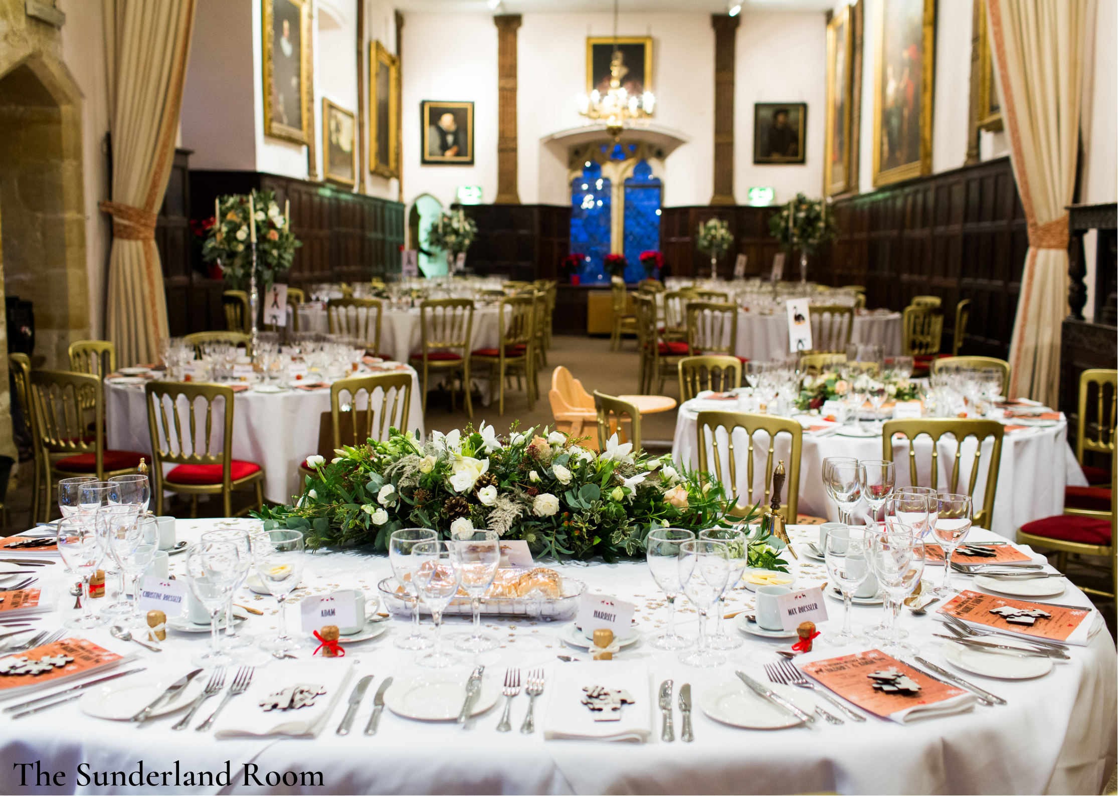
The Sunderland Room