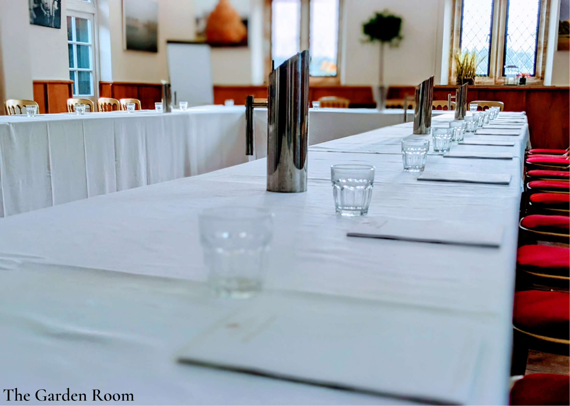
The Garden Room