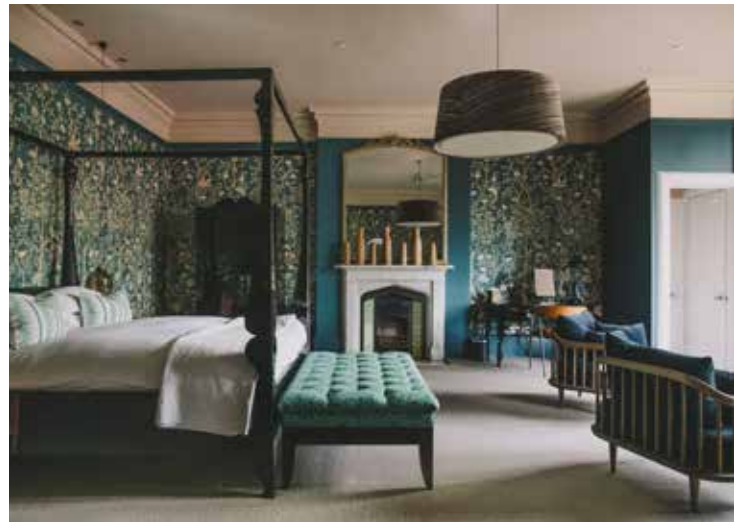
The estate offers up to 24 bedrooms.