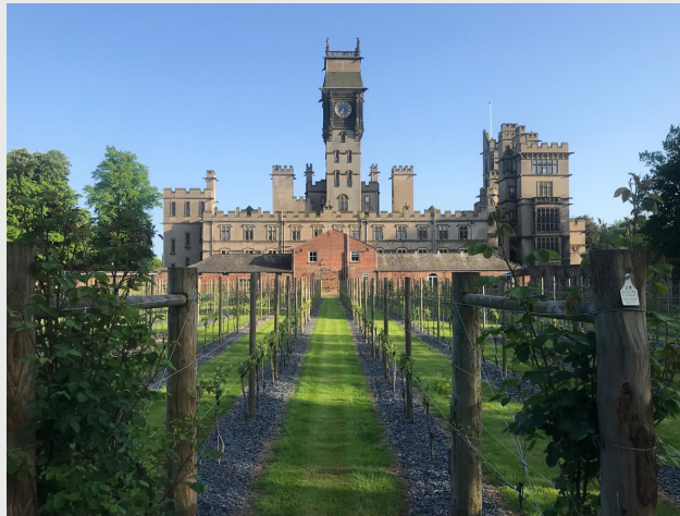
Walled Garden Vineyard