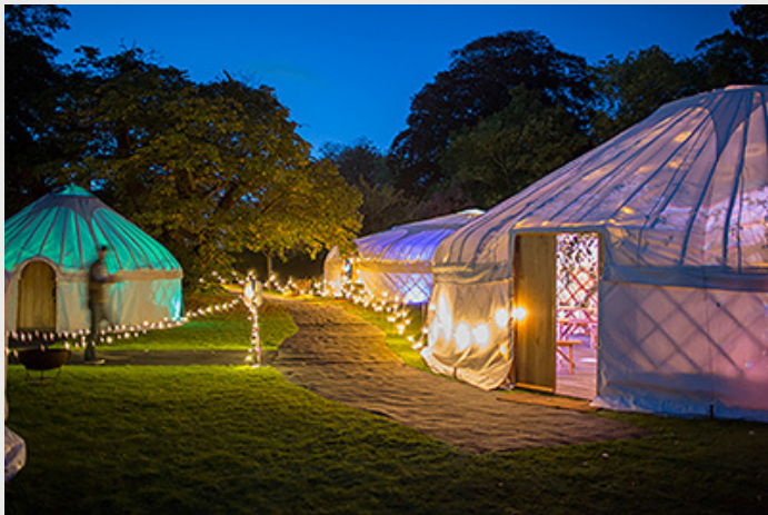
Festivals and Fiestas