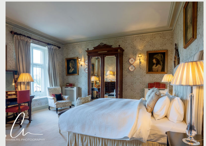
16 Quirky and Individual Bedrooms