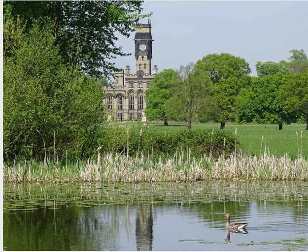
Eight acre lily pond lake