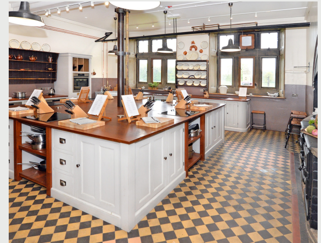
Below Stairs Kitchen and Pantries