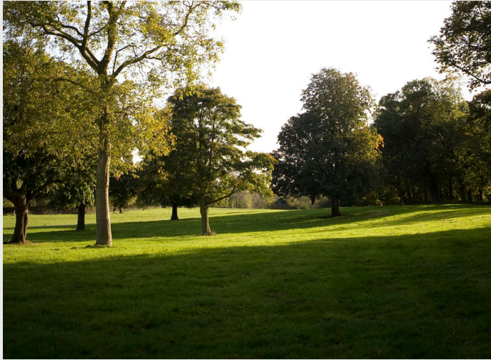
250 acres of rolling parkland

Carlton Towers offers impressive and versatile outside spaces that can be adapted for many filming schedules including: