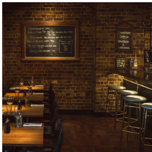
Spitalfields E1 6BJ