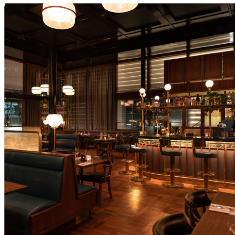
Wood Wharf E14 5GX

All our restaurants are available for full hire. To enquire, please email events@thehawksmoor.com