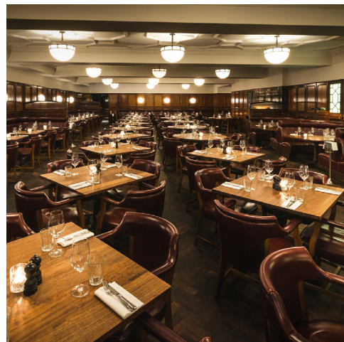
Guildhall EC2V 5BQ