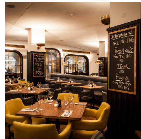
Knightsbridge SW3 2AL