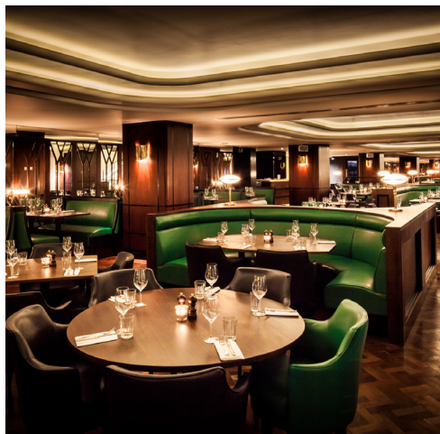
Air Street W1J 0AD