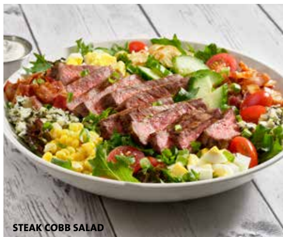
STEAK COBB SALAD

Substitute Grilled Salmon* £20.95 (650 cal)