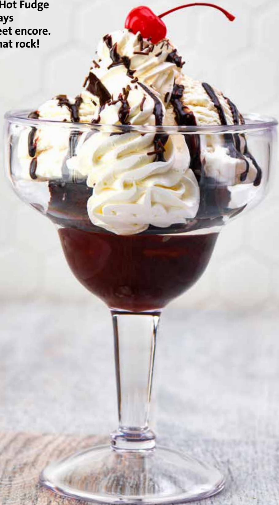
HOT FUDGE BROWNIE

From Milkshakes to Hot Fudge Brownies, nothing says rock n' roll like a sweet encore. Cheers to desserts that rock!