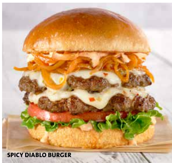
SPICY DIABLO BURGER