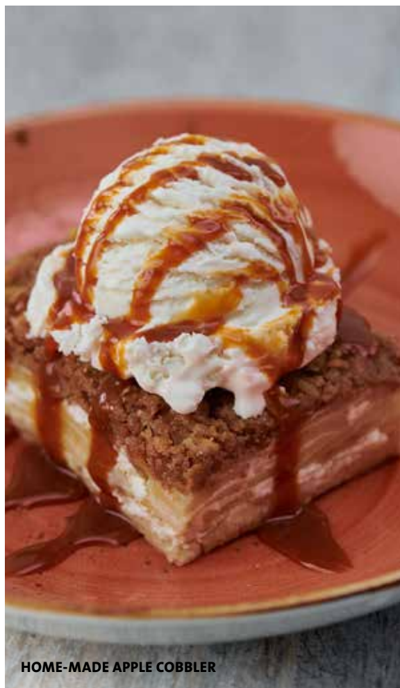
HOME-MADE APPLE COBBLER

Your choice of Madagascar vanilla bean or rich chocolate ice cream blended thick and finished with fresh whipped cream.* £6.95 (529 cal)