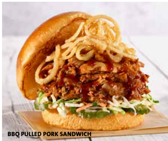
BBQ PULLED PORK SANDWICH

Grilled fresh chicken with melted Monterey Jack cheese, smoked bacon, leaf lettuce and vine-ripened tomato, served on a fresh toasted bun with honey mustard sauce. A £16.95 (1295 cal)