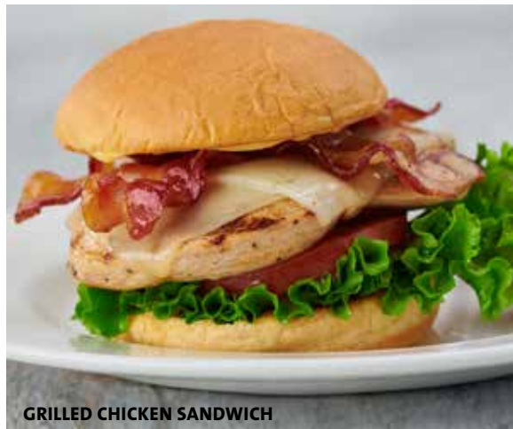
GRILLED CHICKEN SANDWICH