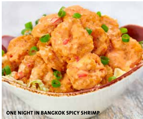
ONE NIGHT IN BANGKOK SPICY SHRIMP