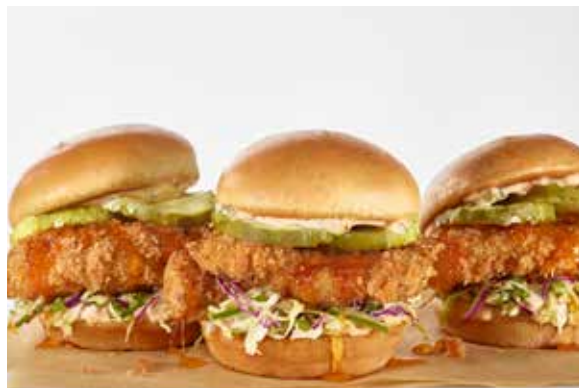
FRIED CHICKEN SLIDERS

Add Guacamole* (GF, VG) £4.95 (125 cal) or Grilled Chicken £5.00 (168 cal) or Grilled Steak* £7.00 (176 cal)