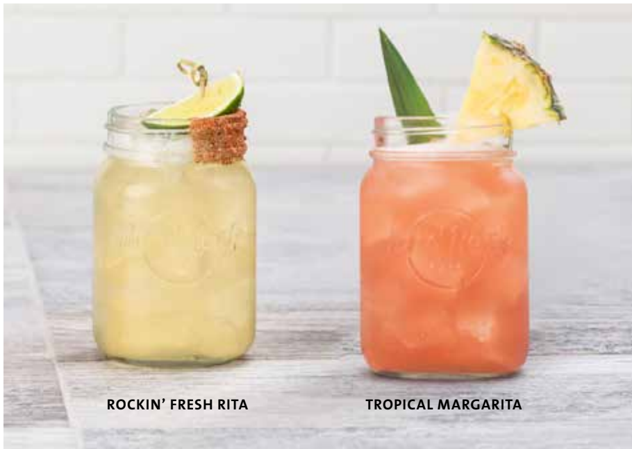
ROCKIN' FRESH RITA

Smirnoff Vodka, Bacardi Superior Rum, Gordon's Gin and blue curaçao with sweet & sour and topped with Red Bull® Yellow Edition. £13.00