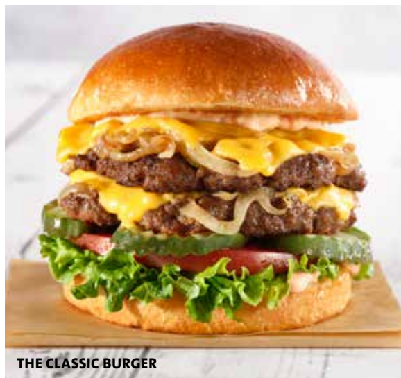
THE CLASSIC BURGER