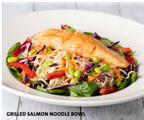
GRILLED SALMON NOODLE BOWL

We hold allergy information for all menu items, please speak to your server for further details. If you suffer from a food allergy, please ensure that your server is aware at the time of order. † Contains nuts or seeds. * These items contain (or may contain) raw or undercooked ingredients. Consuming raw or undercooked hamburgers, meats, poultry, seafood, shellfish or eggs may increase your risk of foodborne illness, especially if you have certain medical conditions. # (GF) Gluten-Free, (V) Vegetarian, (VG) Vegan. A These dishes can be modified for a Gluten-Free, Vegetarian or Vegan option. (GF-A) Gluten-Free available, (V-A) Vegetarian available, (VG-A) Vegan available. Please talk to your server to arrange any dietary needs. 2000 calories a day is used for general nutrition advice, but calorie needs vary. Additional nutritional information is available upon request.