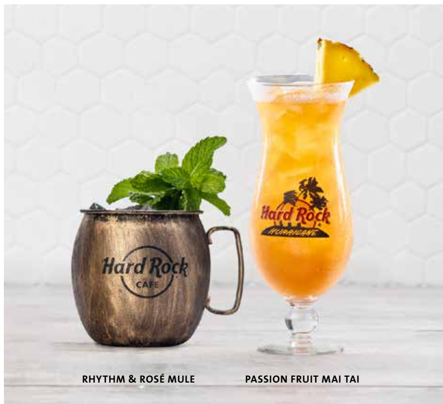
RHYTHM & ROSÉ MULE

Bacardi Superior Rum, Malibu Coconut, crème de banane, grenadine, pineapple and orange juice. £9.25