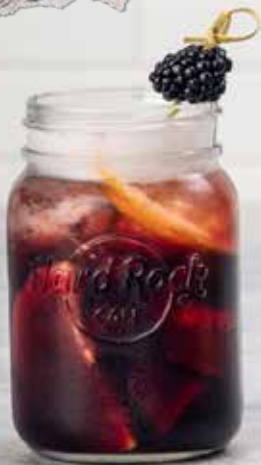
BLACKBERRY SPARKLING SANGRIA