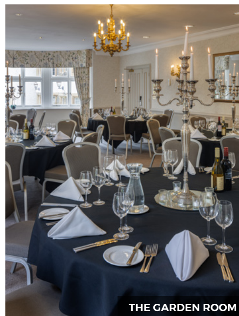
THE GARDEN ROOM