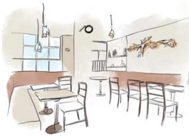
Plates Restaurant 320 Old Street, London