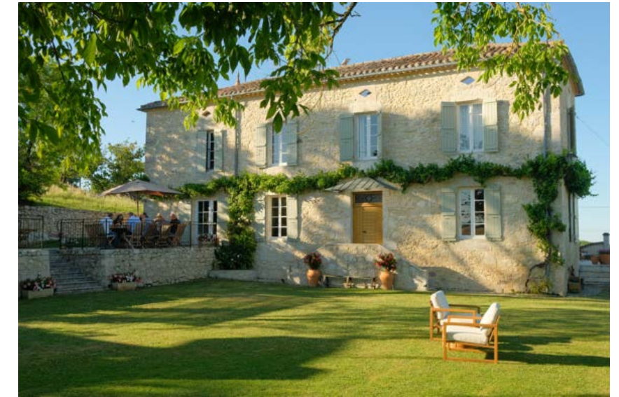
Plates Farm Lectoure, South West France

On Rivington Street, adjacent to the restaurant in the heart of Shoreditch, is our food and drink development studio with private dining and open kitchen.