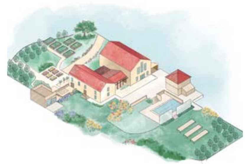
Plates Farm Lectoure, South West France

Old Street (northern line) Shoreditch High Street (overground)