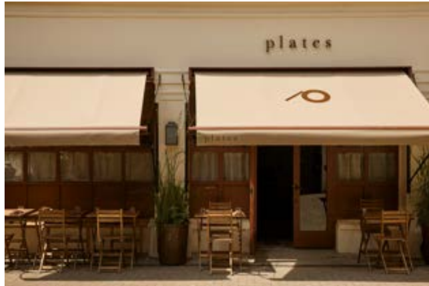
Restaurant 320 Old Street, London

A tailored and intimate group experience at the restaurant promises to deliver unforgettable and unique culinary moments, as we take you deeper into the subject of plant-based luxury dining.