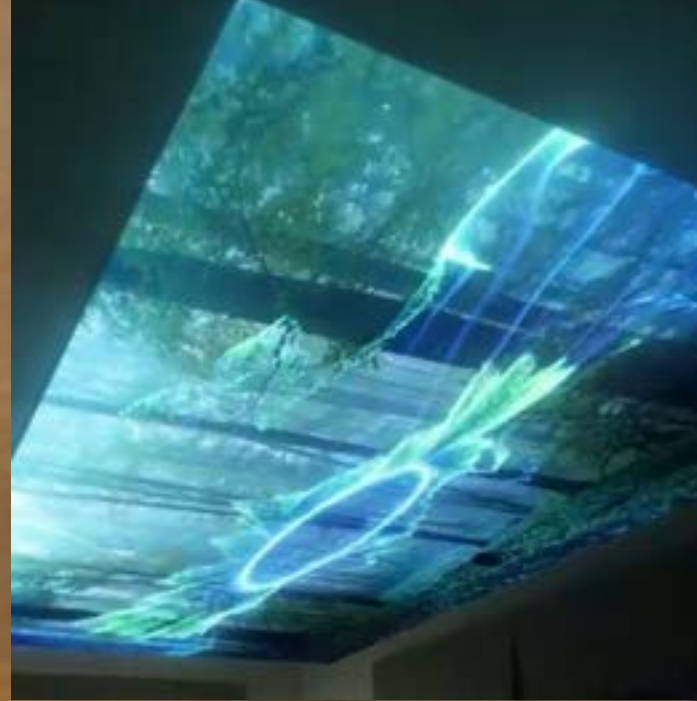
**Projection mapping example for Unearth Your Palate