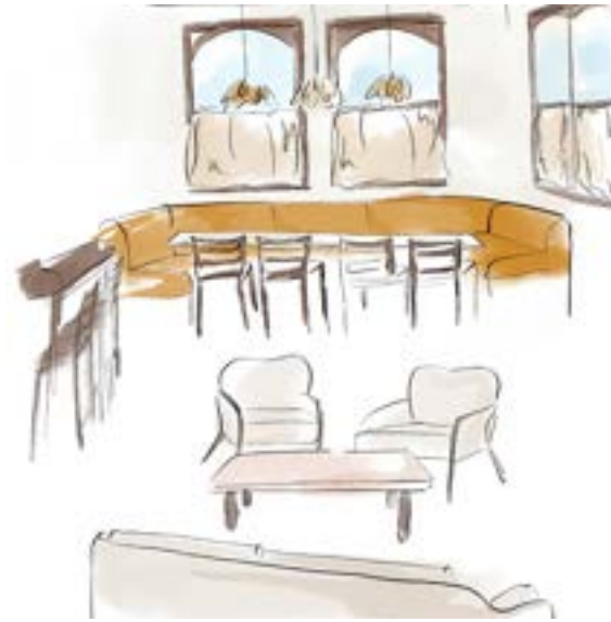
The Food Studio 61 Rivington Street, London

Old Street (northern line) Shoreditch High Street (overground)