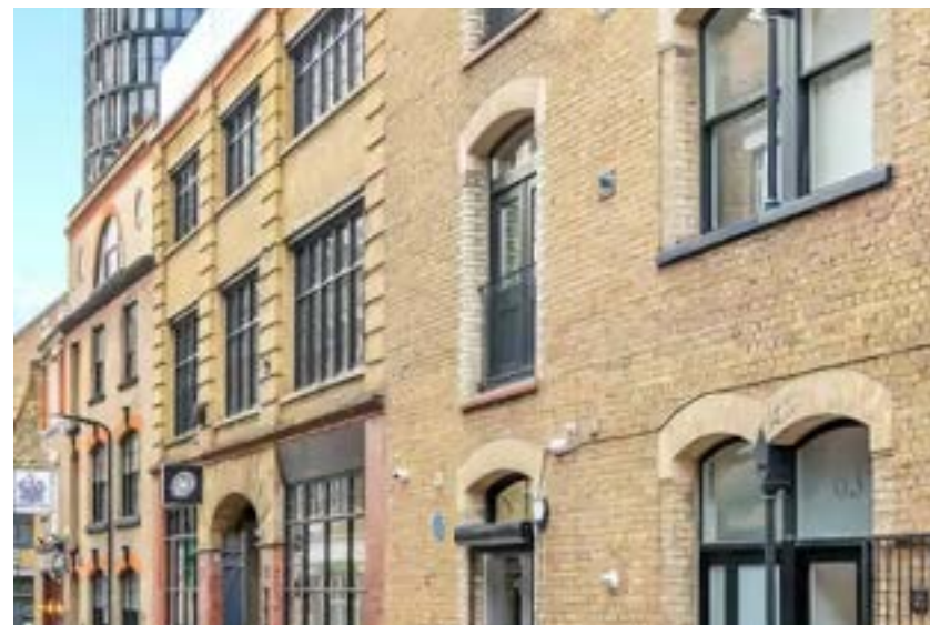
The Food Studio 61a Rivington Street, London

A tailored and intimate group experience at the restaurant promises to deliver unforgettable and unique culinary moments, as we take you deeper into the subject of plant-based luxury dining.