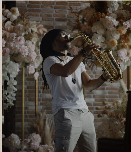
Saxophonist Live Music