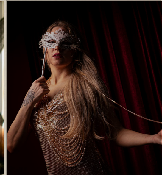
Meet and Greet