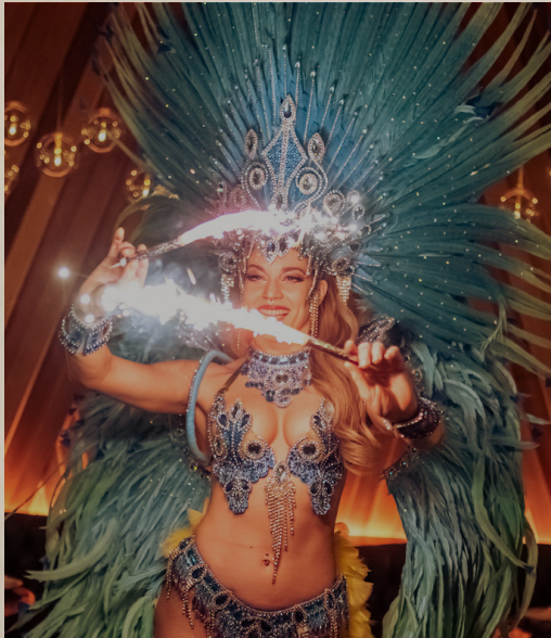
Dance Show Entertainment