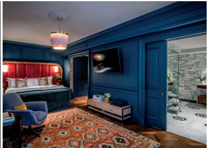
LUXURY STUDIO SUITE

The same blend of historical charm and contemporary chic that defines the hotel's aesthetic also runs through its rooms. An understated décor is blended with period architectural detail, luxurious furnishings and Italian marble bathrooms for a classic feel with a dash of modern designer flair.