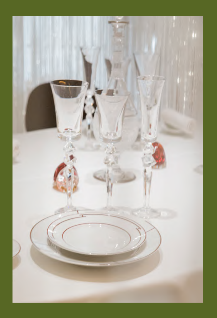
Table // Lumière