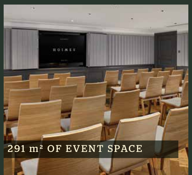
291 m 2 OF EVENT SPACE