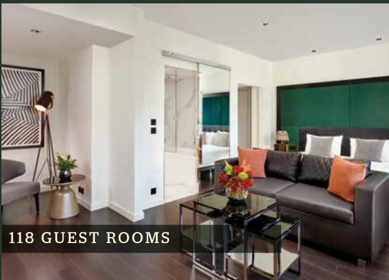
118 GUEST ROOMS