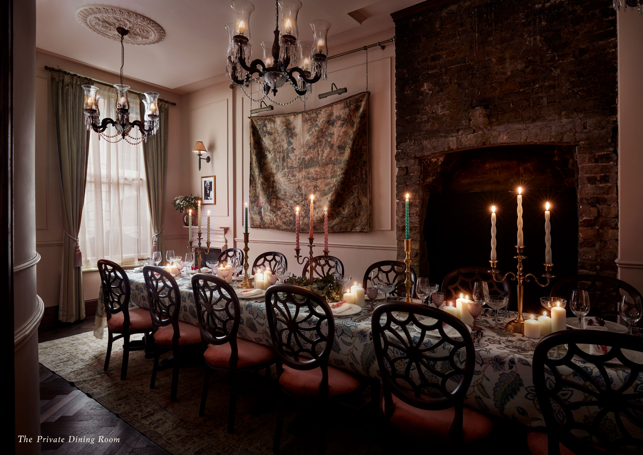
The Private Dining Room