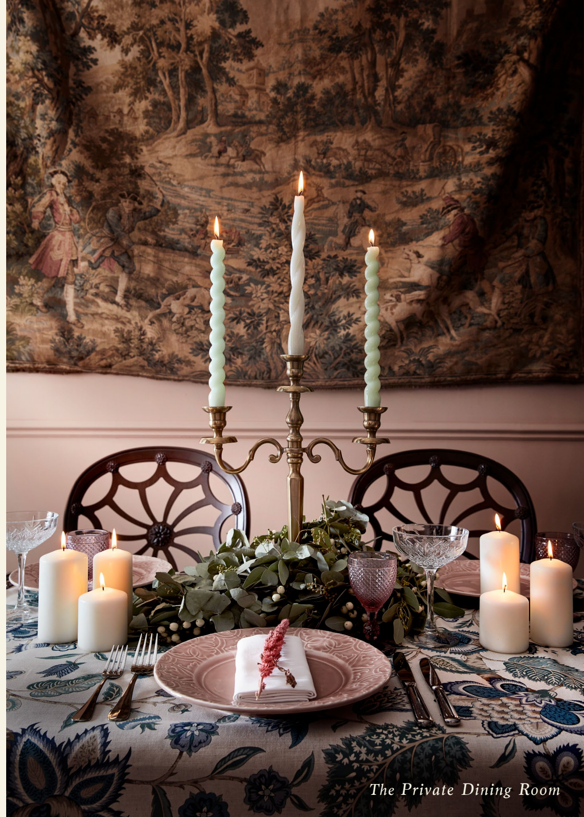
The Private Dining Room

Private room, table service, a state of the art AV system, and WiFi throughout.