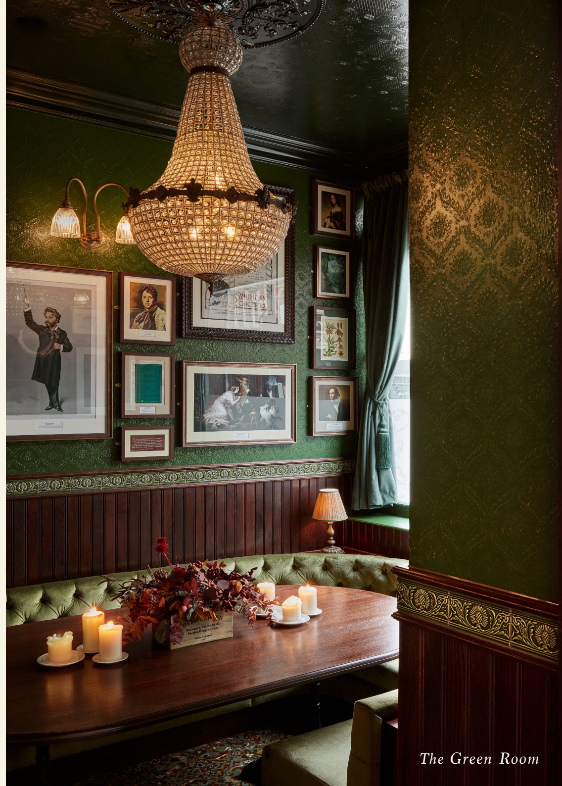
The Green Room

Semi-private space, table service, a state of the art AV system, and WiFi throughout.