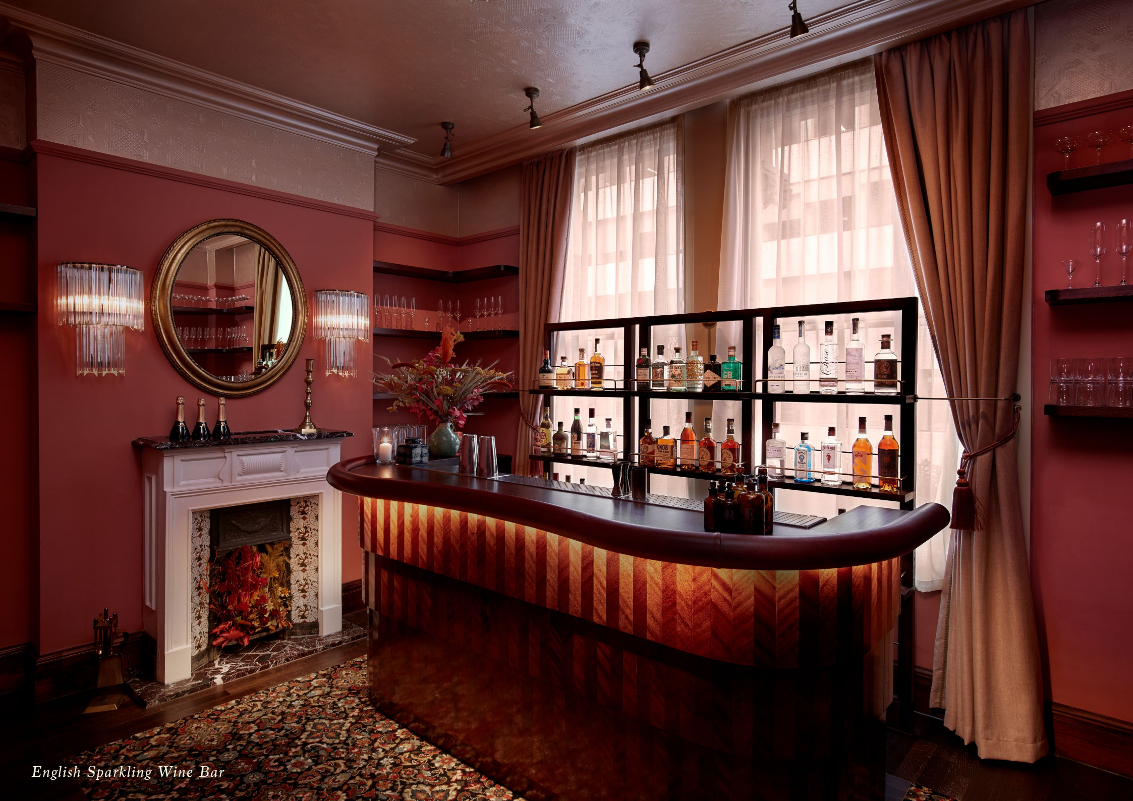
English Sparkling Wine Bar