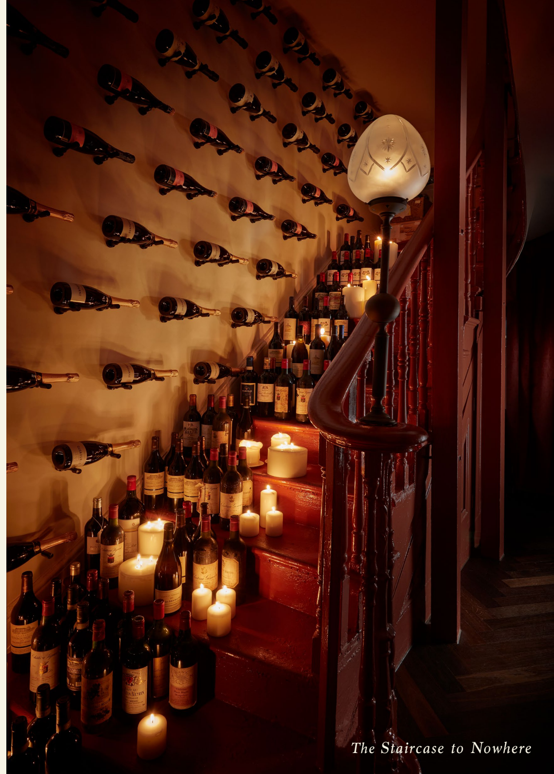
The Staircase to Nowhere

Private room, table service, a state of the art AV system, and WiFi throughout.