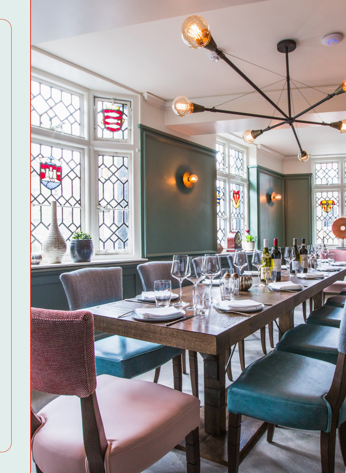
WIFI AVAILABLE TABLE SERVICE