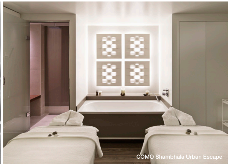
COMO Shambhala Urban Escape