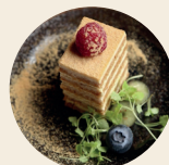
Honey Cake £4