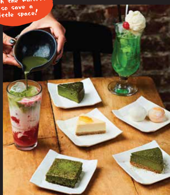
a little dessert preview

worth the wait... so save a little space!