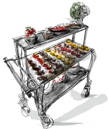
Fig & Mascarpone Tart Yuzu & Black Sesame Praline Choux Caramelised Apple & Vanilla Mousse Peanut Gateaux Marble Cake Lemon Cookies

FOOD ALLERGIES AND INTOLERANCES: SHOULD YOU HAVE ANY QUESTIONS REGARDING THE CONTENT OR PREPARATION OF ANY OF OUR FOOD PLEASE ASK ONE OF OUR TEAM.