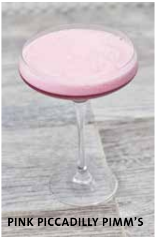
PINK PICCADILLY PIMM'S