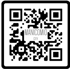
A la carte

In support of British Producers and Farmers at this time, Manicomio Restaurant will be using their produce where possible whilst maintaining our Italian roots.