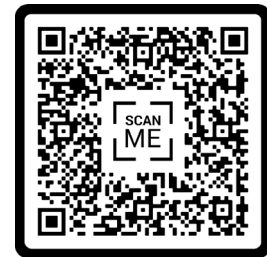
Track & Trace

You are required to either CHECK IN via the NHS App OR provide your details via our track and trace system. Please take a moment to have this done on your arrival.