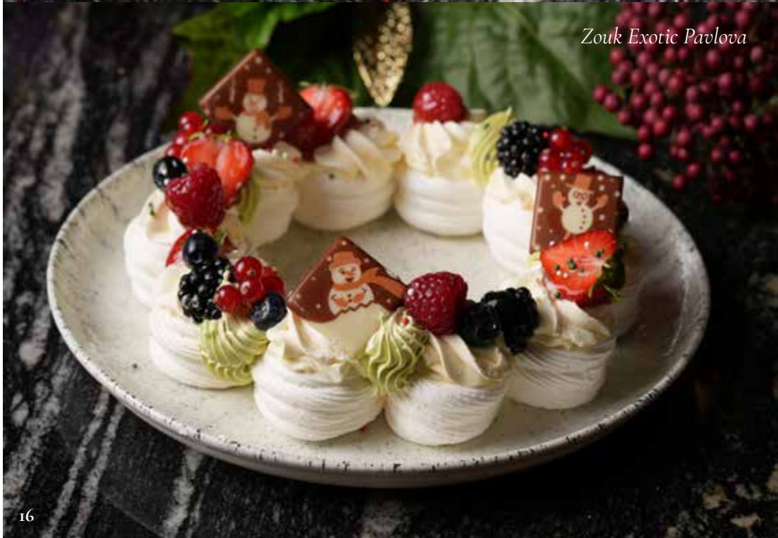
Zouk Exotic Pavlova