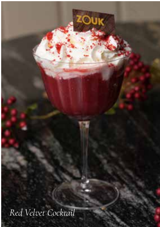
Red Velvet Cocktail