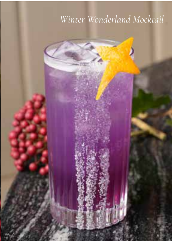
Winter Wonderland Mocktail