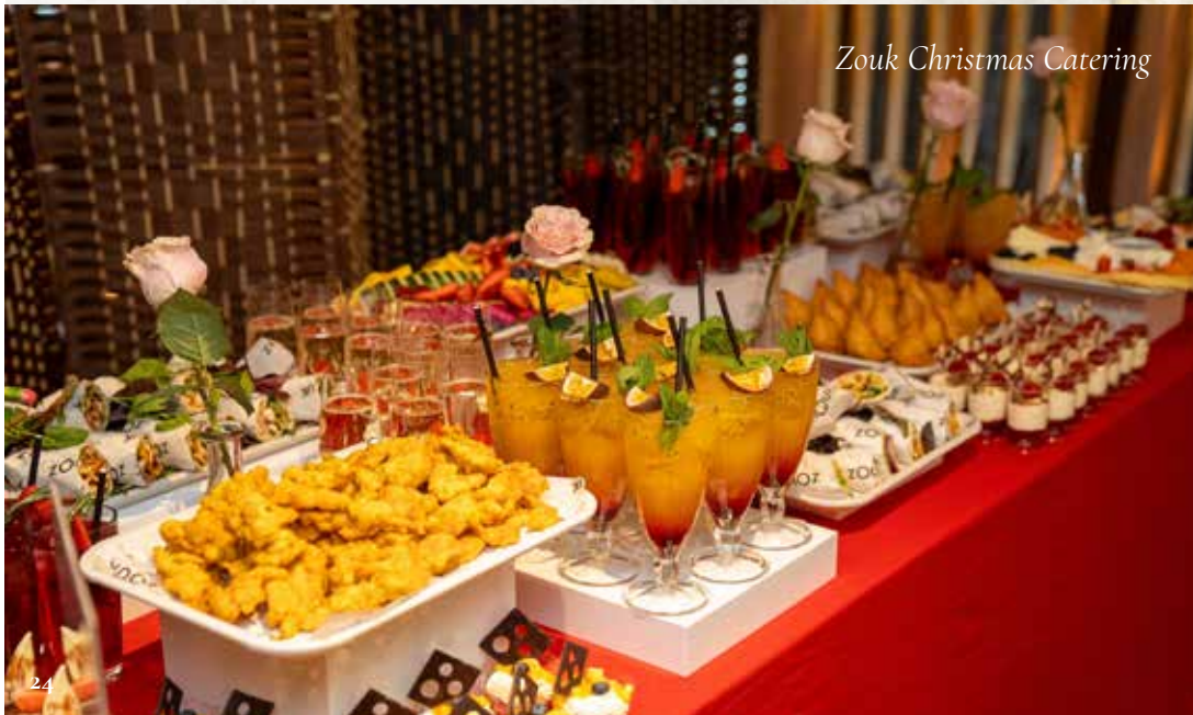
Zouk Christmas Catering

Make this year's office celebration one to remember – with the irresistible taste of Zouk.